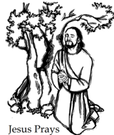
Jesus Prays for his disciples.