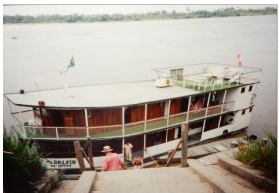
Boarding the Delfin in Iquitos, Peru

might be a safer way for you to explore some of the exciting history of the Amazon.