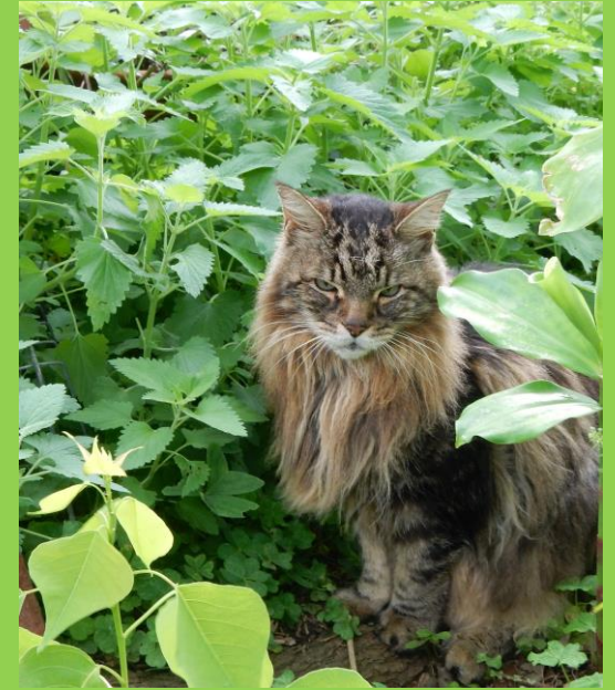
Puffy standing guard in the Catnip patch