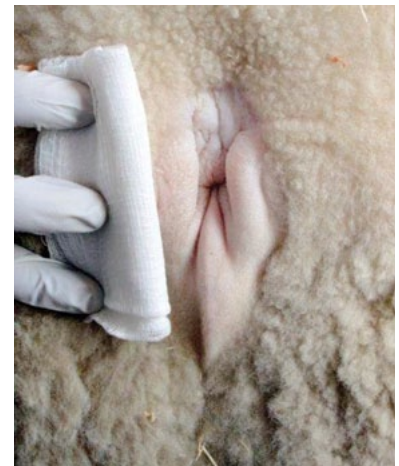
Figure 3. Pale perineum in a sheep with severe anemia due to a high burden of stomach worms. A white gauze is shown for color comparison.