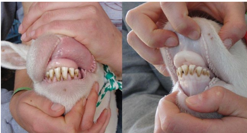
Figure 2. Comparison of the gums of a normal sheep (left) and a sheep with severe anemia due to a high burden of stomach worms (right).

Treatment should be adjusted to the worm burden. When the burden is very high, killing all parasites at