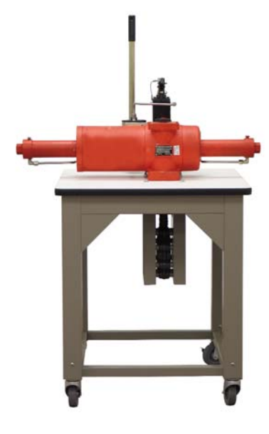
H-MVOT-2X (Set 3) Motorized Valve Operator Trainer Cutaway