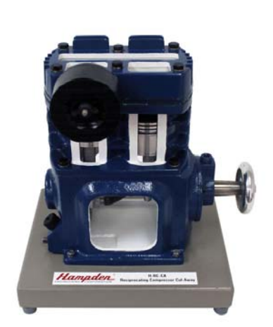
H-RC-CA Reciprocating Compressor Cutaway