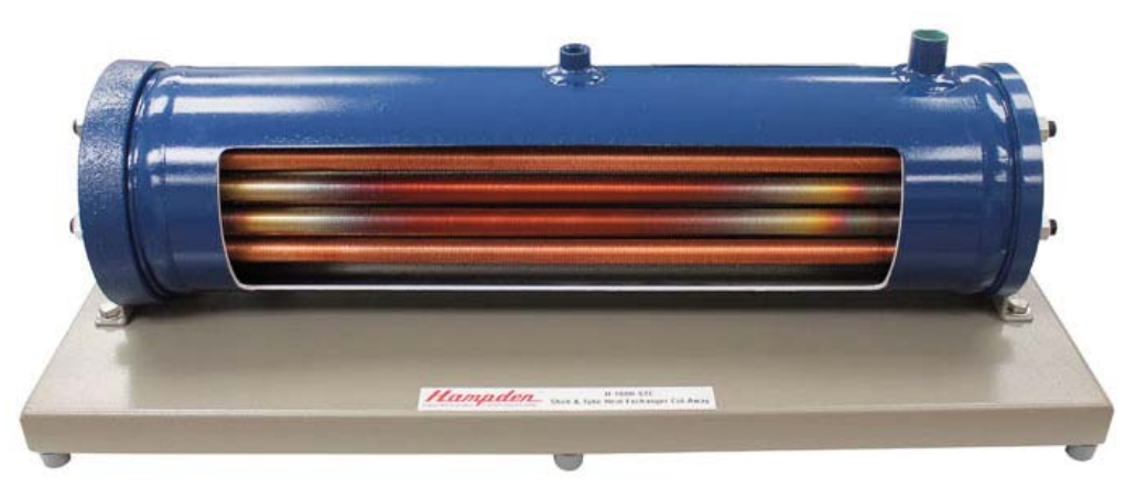
H-1600-STC Shell and Tube Heat Exchanger Cutaway