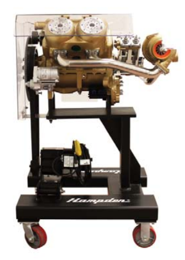
H-DH-160V4-CA Engine Cutaway on Mobile Stand