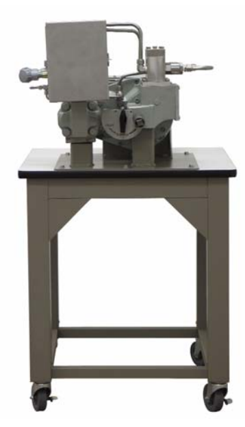
H-MVOT-2X (Set 2) Motorized Valve Operator Trainer Cutaway