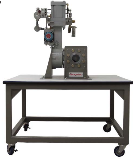
H-MVOT-X Motorized Valve Operator Trainer Cutaway