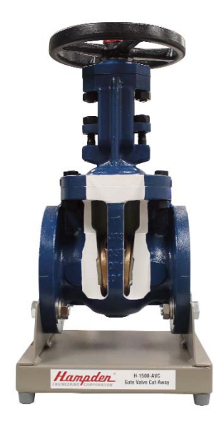
H-1500-AVC-B Gate Valve Cutaway with Base

Hampden Model 1500 Series Cutaway Valves allow for convenient classroom training for the operation, construction, and maintenance of common industrial valves. Through carefully planned sectioning and color-coding, the complete internal configuration of each valve is exposed and showcased. Seal features and hardware locations have been retained, allowing use for "hands-on" training in maintenance.