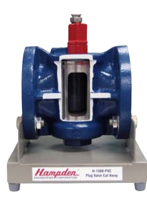
H-1500-PVC-B Plug Valve Cutaway with Base