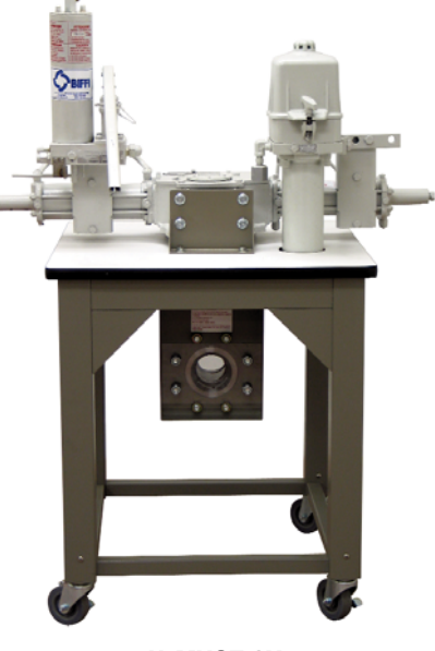
H-MVOT-2X Motorized Valve Operator Trainer Cutaway