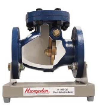
H-1500-CVC-B Check Valve Cutaway with Base