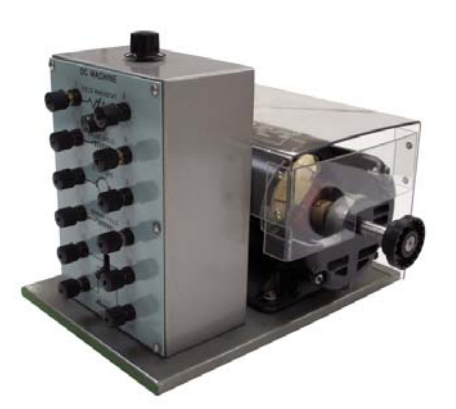
H-DM-100-CA-R DC Machine Cutaway