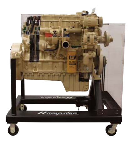
H-CA-C7-CA Caterpillar C7 Engine Cutaway on Mobile Stand