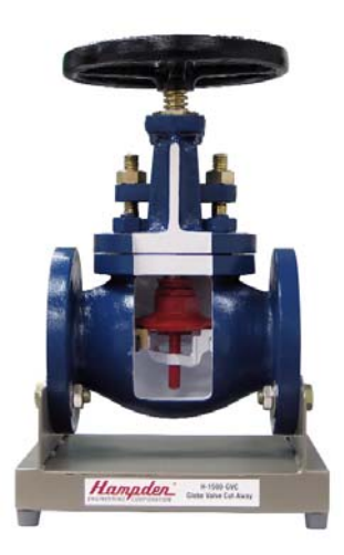
H-1500-GVC-B Globe Valve Cutaway with Base