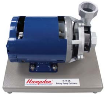
H-FP-CA Rotary Pump Cutaway