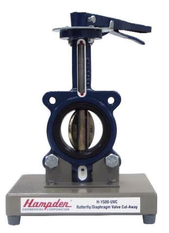
H-1500-UVC-B Butterfly/Diaphragm Valve Cutaway with Base