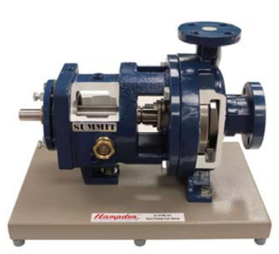
H-3196-ST Ansi Pump Cutaway