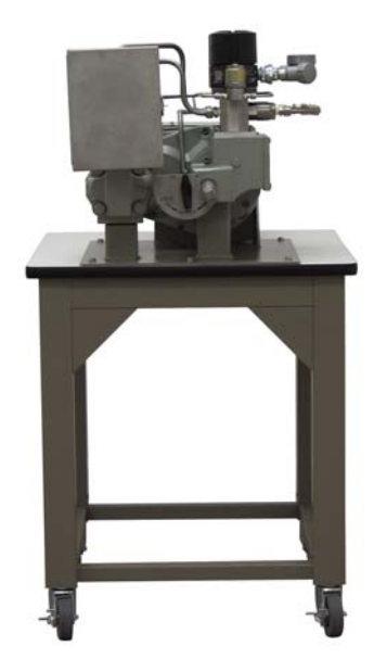
H-MVOT-2X (Set 1) Motorized Valve Operator Trainer Cutaway