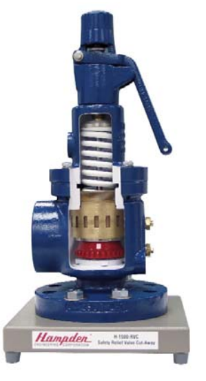
H-1500-RVC-B Safety Relief Valve Cutaway with Base

H-1500-ACVC-B Adjustable Check Valve Cutaway with Base H-1500-AVC-B Gate Valve Cutaway with Base H-1500-BCVC-B Ball Check Valve Cutaway with Base H-1500-BTVC-B Barrel Type Valve Cutaway with Base H-1500-BVC-B Ball Valve Cutaway with Base H-1500-CAVC-B Control Air Valve Cutaway with Base H-1500-CVC-B Check Valve Cutaway with Base H-1500-DFVC-B Double Flanged Valve Cutaway with Base H-1500-ESDVC-B "ESD" Valve Cutaway with Base H-1500-GVC-B Globe Valve Cutaway with Base H-1500-LCVC-B Lift Check Valve Cutaway with Base H-1500-NRSVC-B Non-Rising Stem Valve Cutaway with Base H-1500-NVC-B Needle Valve Cutaway with Base H-1500-PVC-B Plug Valve Cutaway with Base H-1500-RSVC-B Rising Stem Valve Cutaway with Base H-1500-RVC-B Safety Relief Valve Cutaway with Base H-1500-SCVC-B Swing Check Valve Cutaway with Base H-1500-UVC-B Butterfly/Diaphragm Valve Cutaway with Base H-1500-WVC-B Wafer Type Valve Cutaway with Base