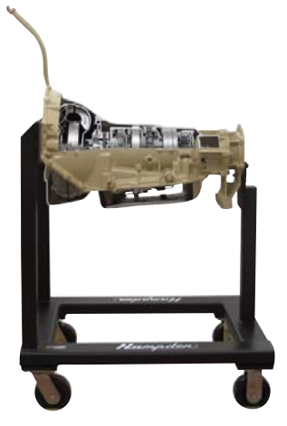
H-HMMWV-4L80E-CA Humvee Transmission Cutaway on Mobile Stand