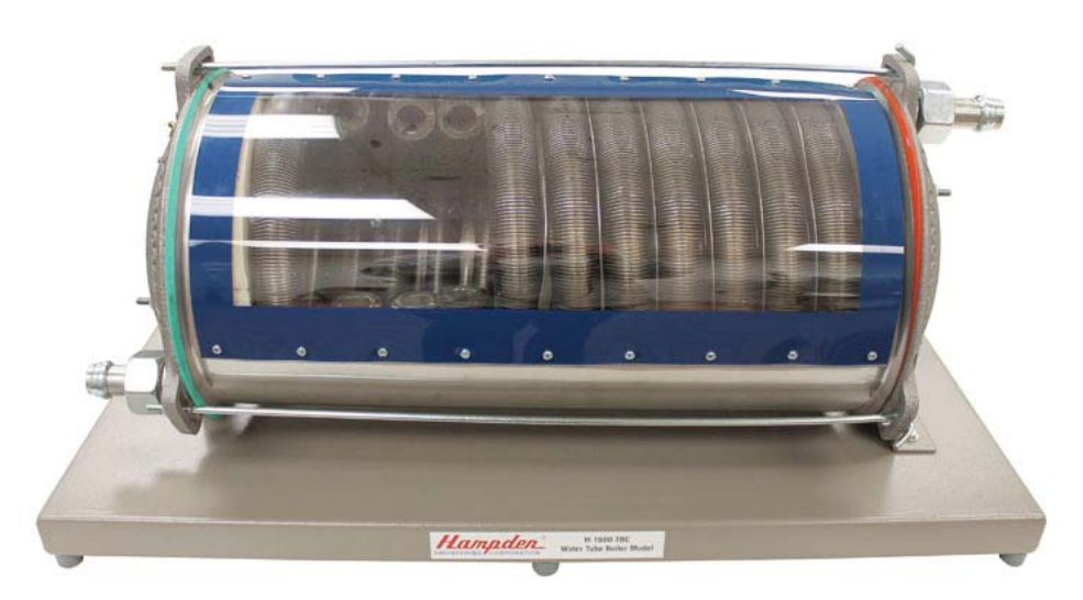
H-1600-TBC Water Tube Boiler Cutaway

H-1600-MPM Multi-Pass Floating Head Model