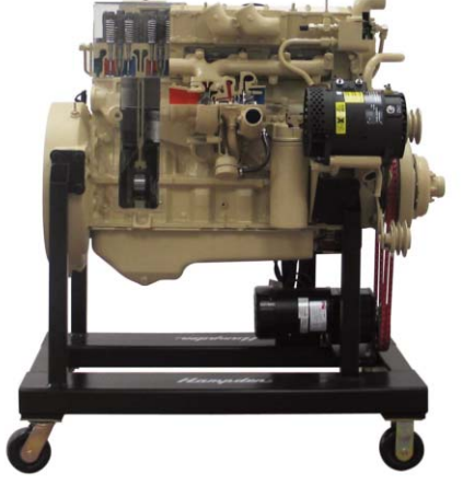
H-CAT-3116-CA Caterpillar Engine Cutaway on Mobile Stand