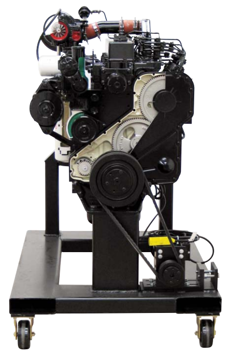
H-CD-46C-CA (4 cycle, 6 cylinder "C") Cummins Engine Cutaway on Mobile Stand