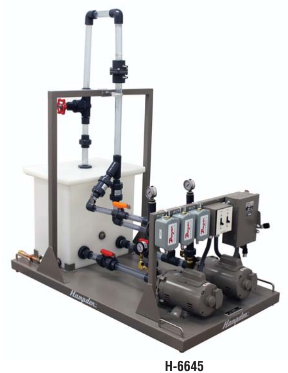
Beries/Parallel Pump Trainer

The Hampden Model H-6645 Series/Parallel Pump Trainer is a tabletop unit for the operation and investigation of series and parallel pump operation. The trainer consists of two centrifugal pumps that are fed by a common water reservoir and a PVC plumbing arrangement, along with five valves that allow various configurations to be implemented.