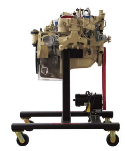
H-HMMWV-6.5-CA Humvee Engine Cutaway on Mobile Stand