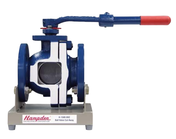
H-1500-BVC-B Ball Valve Cutaway with Base