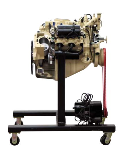
H-HMMWV-6.2-CA Humvee Engine Cutaway on Mobile Stand