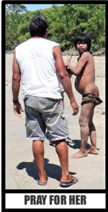
PRAY FOR HER

It's not just US$ 50.00 a year/month that make God's missions like Amazon Missions operate, but most of the times the frowned upon US$ 5.00 or 10.00, which people stopped sowing, because they thought it to be of too little value and inferior. God uses any amount of money.