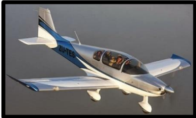
SLING 4 - AIRCRAFT IN FLIGHT

We are open to purchase any aircraft, but the planned airplane is the Sling TSi, designed, developed and manufactured in Gauteng, near Johannesburg (south of Uncle Charlie's) close to the town center of Eikenhof, a little way south on the old Vereeniging Road. A couple of 100 yards away from where I grew up in the 1960's. Who would've known that the Amazon Missions' prospective airplane, was going to be built a short distance from my childhood home? The Sling TSi does short/ soft field takeoffs and landings, as is necessary in the Amazon. It cruises intercontinentally on car gas at economical costs.