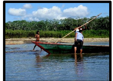
UNREACHED ENCOUNTER - FISHING

Amongst many things, our giving towards God, brings freedom (ourselves, being so challenged). People get discouraged to sow finances for God's work, misperceiving their amount to be too little. Then they surrender to no avail. Your US$ 5.00 or 10.00 mean more than you think! It's attitude ... not what you give, which qualifies. Don't despise the day of small beginnings. Zechariah 4:10. God does the wonders with what you bring to Him!