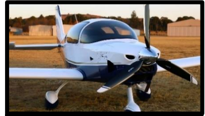
SLING TSi - AIRCRAFT - JHB

The South African developed Sling is internationally acclaimed as one of the top 5 sport (type) airplanes, having won itself a place in the Guinness World Book of Records for the fastest time (non-stop) in a 2-seater airplane between Argentina and South Africa. Flown on Mogas (car gas/petrol), its reliability was proved by going around the world. Its operating cost is around US$ 60/hr at 155 kts cruising (TAS), burning 7-8 G/ph/ 28 L/ph of car gas/ petrol, while at 130 kts operating cost is much lower. It reaches Natal, Brazil from Conakry, Guinea, Africa, cruising at 130 kts, an altitude of 18 000 ft/ 5487 m, covering 1830 mi/ 1590 n.mi/ 2944 km. The maximum range of 800 n.mi (1482 km) is extended by placing a hopper tank on the back seat. With a maximum gross weight of 2095 lb/ 950 kg (it has an emergency aircraft parachute) and an empty weight of 1080 lb/ 490 kg (useful load 1015 lb/ 460 kg) it weighs lighter than the same type of aircrafts but loads more than they do. The lighter Rotax 915 iS Turbocharged Intercooled Engine climbs at a 1000 ft p/min/ 305 m p/min pushing out 141 hp. This plane costs US$ 180 000.00 - 64% less than the cost of other planes of its class and type. Compare the statistics with aircraft of its category, class and type and see how the overall economy and optimal efficiency, surpasses them.