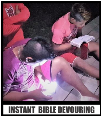
INSTANT BIBLE DEVOURING

We're using this plane, in the place of a car, for witness tours internationally, continuing to advocate God's work in the Amazon, as we've done for the past 27 years. Our main drive continues to be reaching more tribes for JESUS, more effectively with the plane, taking Bibles in to the Amazon Jungle. Everyone's support towards this mission of God is catapulting us into more resourceful ways of doing this.