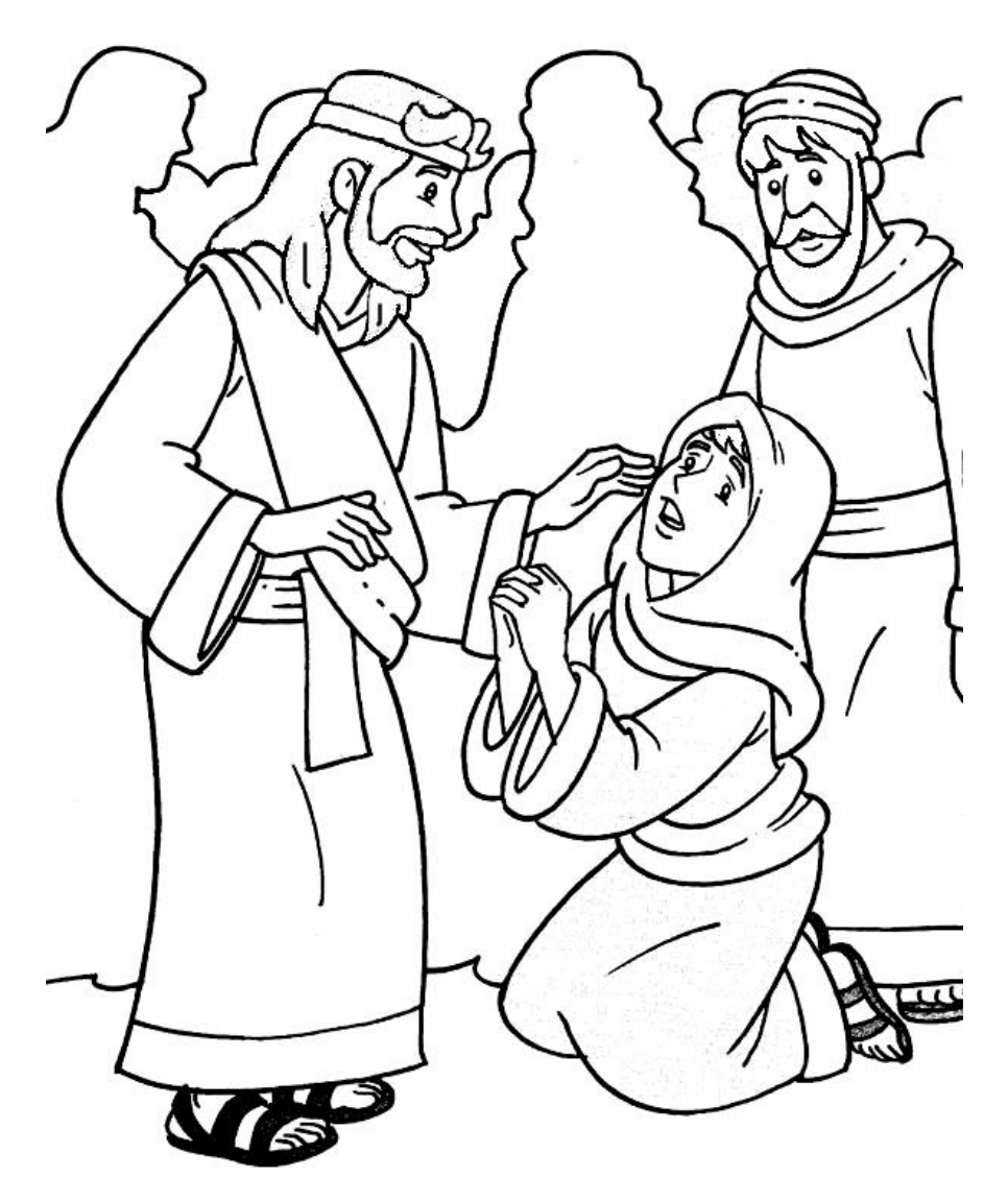
"If I just touch his clothes, I will be healed." Mark 5:28