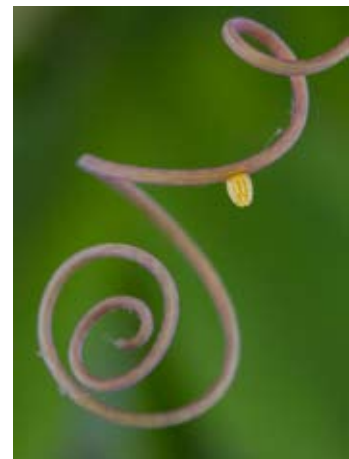
Gulf Fritillary Egg on Passion Vine Flower - 26 Linda Avitt