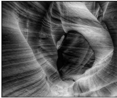
Lower Antelope - 27 Linda Sheppard