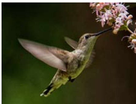
Yum - 27 Paul Munch