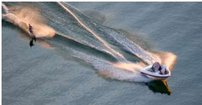
Last Run of the Day - 26 Matt Henderson