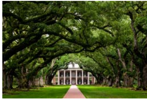
Oak Alley - 27 Rose Epps