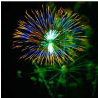
Rockets Red Glare - 26 Beverly McCranie