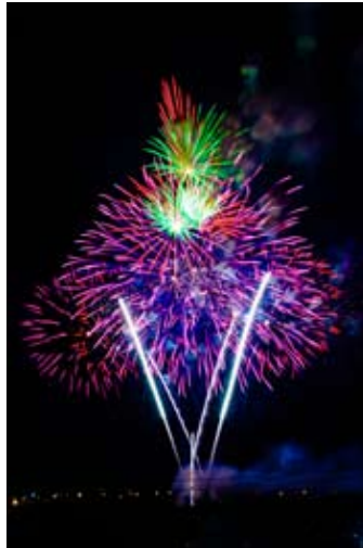
Bomb Bursting in Air - 27 Dolph McCranie