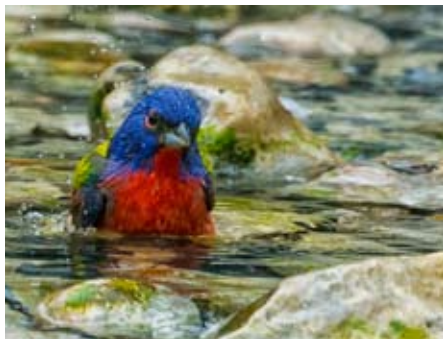
Splash Splash - 27 Paul Munch