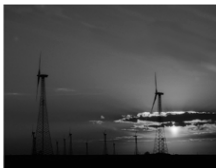
Night Winds - 27 Sheldon Lloyd