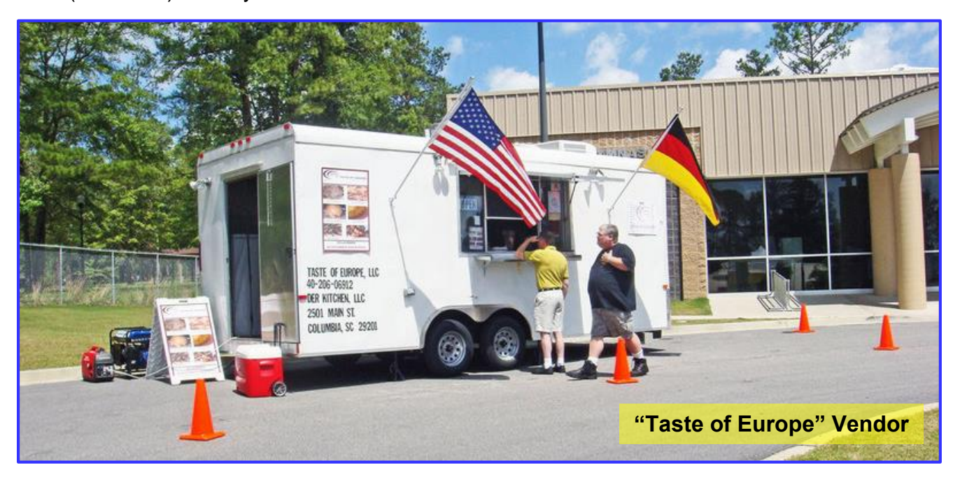
A "Taste of Europe" offered authentic German Schnell Imbiss fare with Wurstchen, Schnitzels, Pomm Frittes, etc.

Concessions. Because our show this year was a little off the beaten path, and to help keep our show patrons and guests feel like they didn't need to go somewhere else for lunch, we invited a couple of local concession vendors to come and offer food, drinks and something cool for a (REALLY!) hot day.