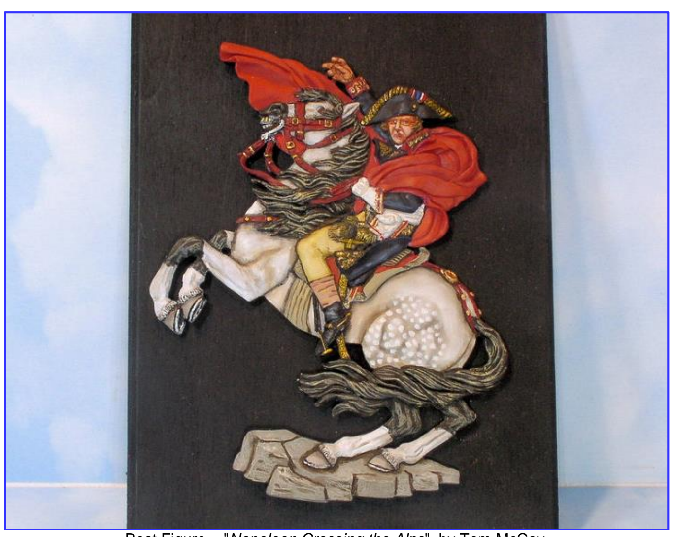
Best Figure – "Napoleon Crossing the Alps", by Tom McCoy