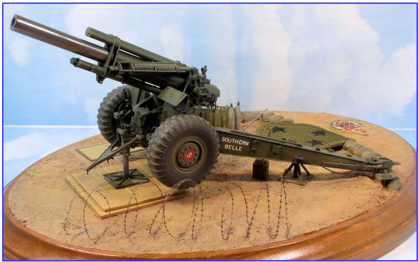
Judges' Best in Show & Best US - "M114A1 155mm Howitzer", by Carl Wethington