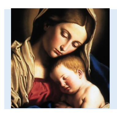
Holy Day of Obligation