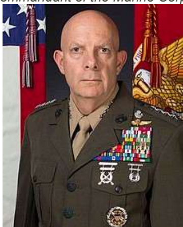
David H. Berger General, U.S. Marine Corps Commandant of the Marine Corps

“The wonderful love of a beautiful maid, The love of a staunch true man, The love of a baby, unafraid, Have existed since time began. But the greatest of loves, the quintessence of loves. Even greater than that of a mother, Is the tender, passionate, infinite love, of one drunken Marine for another. Semper Fidelis”