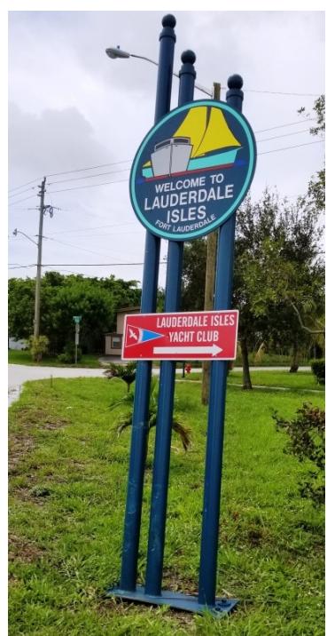
A bent metal base & cracked concrete footing by a hit & run on June 13.

Lately, life is tough for signs in Lauderdale Isles.