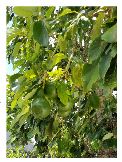
Guacamole time: avocados start to ripen in the fall. (You can start Weightwatchers after the New Year).