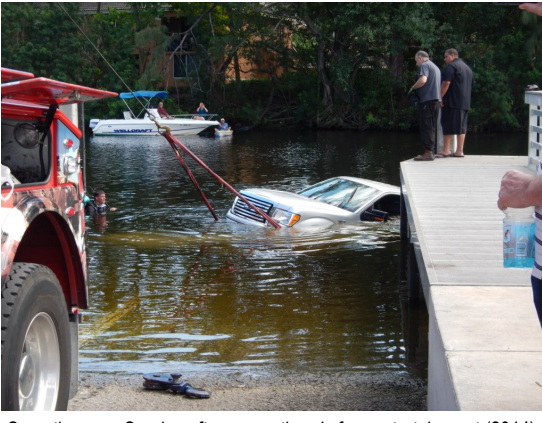
Sometimes on Sunday afternoons, there's free entertainment.(2014)