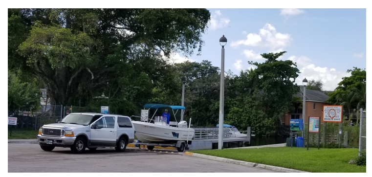
On weekends, the ramp is busy, but there's never a long wait to launch.