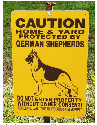
On Key Largo Lane. Would <u>you</u> knock on the door?

In response to neighbors's concerns, FLPD has located the Peacekeeper again on Riverland Road. Its operational capabilities are confidential, but it does say "surveillance," — and those are gun ports under the windows.