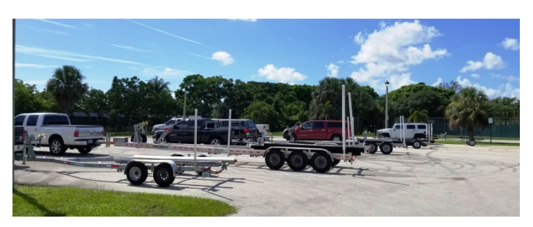
The parking lot fills up sometimes, but it's easy and convenient to just have a crewmember drive the truck and trailer home.

LittleFreeLibrary.org 2661 Key Largo Lane