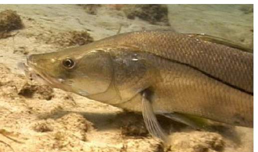
There are huge snook at the boat ramp in winter