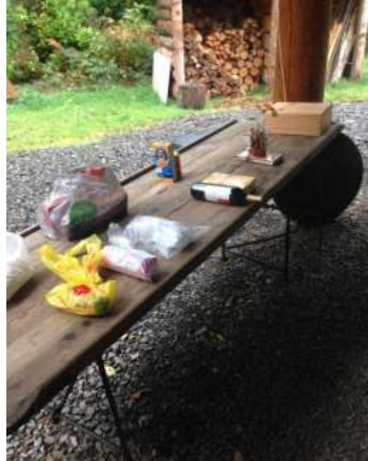
Prizes ready for a Thanksgiving meal

Shooting started with some practice shots at some of the stations along the trail walk as we made our way down to the covered range area. I was introduced to the “Nuts and Bolts” target, as well as some of the others. It’s a good thing we took these practice shots, and I discovered that I needed the practice. No scores for this area, just “braggin’ rights”. Once at the range area we broke into small groups and started shooting, stopping every now and then to retrieve our cards. There was no scoring on the cans or veggies, and most people had fun making salad. A few shots were taken at the long range buffalo target.