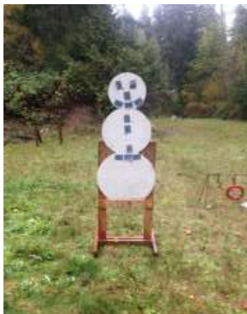
Some of the cards were on the snowman

At 9:30 we gathered for the safety briefing and the firing order. Gene DuVall laid out the course, which was focused on four target, each of which had cards stapled face down to it. The object was to shoot one card from each target, then see what your poker hand was. In order to keep things in order, each target had cards from only one suit. This meant you had only a four card hand. Of course, if you missed a card, you might have only a three or a two