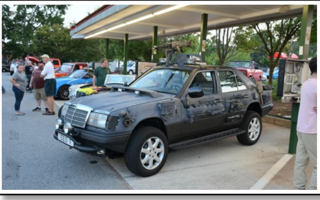
See our Facebook Page for MORE Photos!