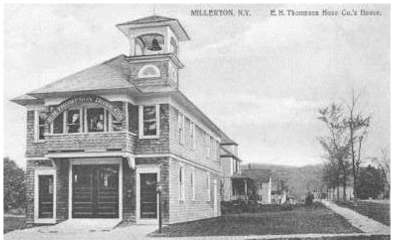
The Millerton Village Hall was once the Millerton, NY C.H. Thompson Hose Company