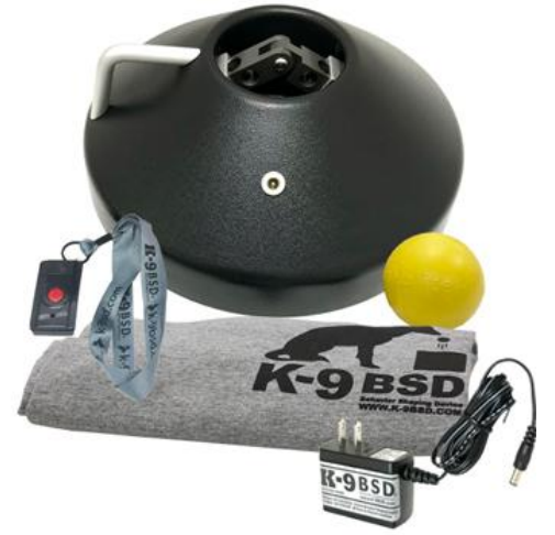
K-9 BSD-3R, Remote Ball Launcher with Black cover

The Prairieland Standard Schnauzer Club of Central Illinois (PSSC) donated a behavior shaping device (BSD) to the Normal Police Department to be used in the training of dogs by the Normal, Illinois and Bloomington, Illinois Police Departments and the McLean County Sheriff's Office. The K9 BSD or Behavior Shaping Device can be a valuable tool in shaping detection dog behavior. The device is most effective on dogs when behavior can be controlled with ball, tug etc. in a variety of different environments. The trainer controls the training as the K-9 BSD is just a unique tool to expand positive reinforcement training.