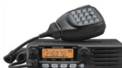
TM-281A 2 Mtr Mobile