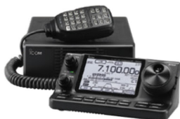
IC-7100 All Mode Transceiver