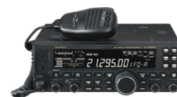
FT-450D A100W HF + 6M Transceiver