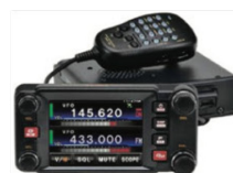
FTM-400XD 2M/440 Mobile