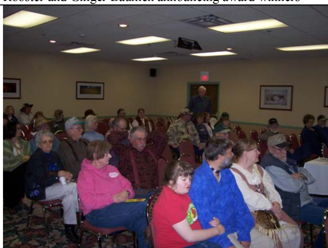
Good Attendance at General meeting