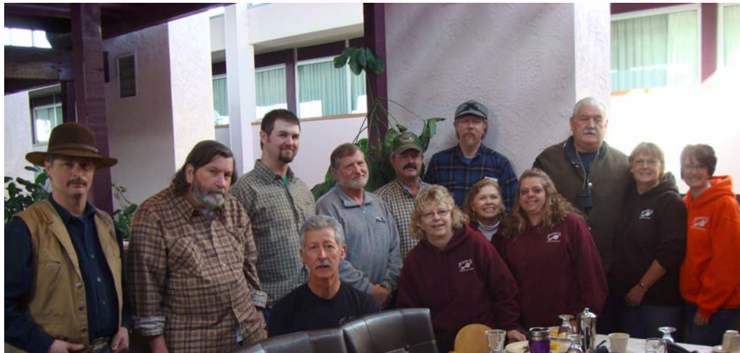
WSMLA Board for 2010