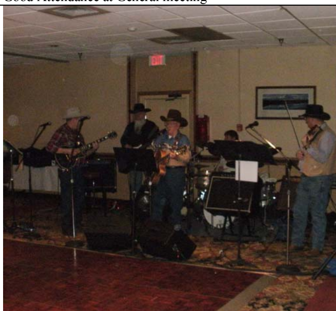
2009 WSMLA Band: Swing Sounds from Casper. Great job guys!