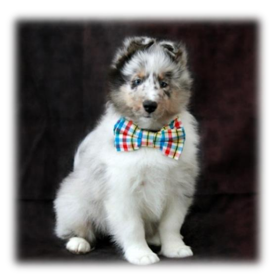
Has one blue eye and one brown

The pups are in Maryland. E-mail for more info: fairbrookshelties@gmail.com or text (815) 608-6110