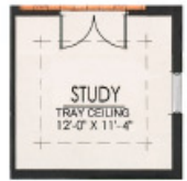
STUDY OPTION IN LIEU OF DINING