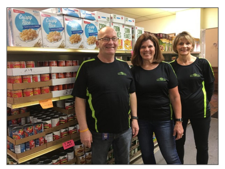
Volunteers chatted with lots of folks at the Springboro Expo 2019 about the Pantry mission.