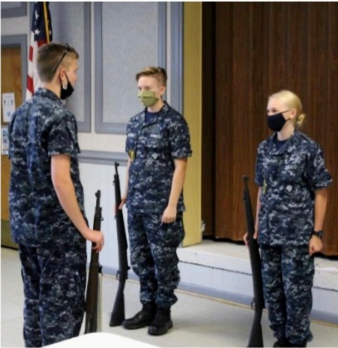
Sea Cadets participated in a regular drill at the American Legion Post 284, Colonial Heights on August 8.