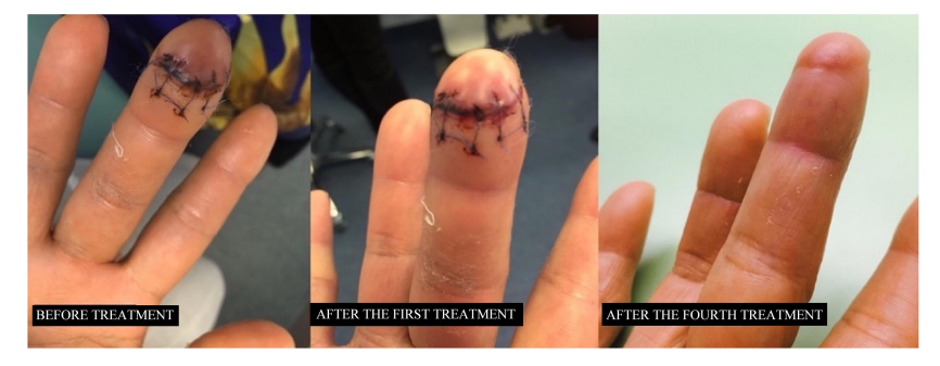
Figure 2. Before the first treatment, after the 1st treatment and the 4th treatment.