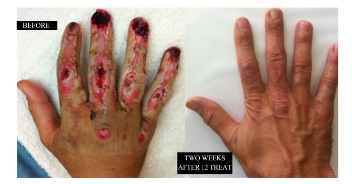
Figure 1. Traffic accident wound. Before treatment and two weeks after the 12<sup>th</sup> treatment.