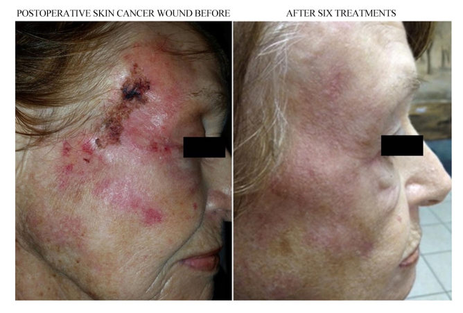
Figure 6. Postoperative wound prior to treatment and after six treatments.

This 28-year-old female got a second degree burn after accidently spilling hot boiling soup on her thighs. She went to the hospital for emergency care and then saw the doctor who offered her 4 ultra-low energy nanotechnology treatments over a period of two weeks. The day after the first treatment the patient reported extensive healing that became more visible two days after the first treatment. The post inflammatory pigmentation observed after the third treatment was reduced after the fourth treatment ( Figure 8 ). The patient reported that two weeks after her four treatments the pigmentation was significantly lighter, and the skin of her thighs appeared to be normal, The judges' mean average scores were: BTSR 3.3; BTDR 2.3; ATSR: 8.3; ATDR: 7.6.