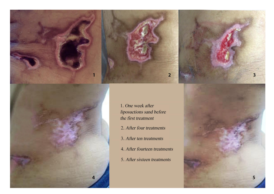
Figure 4. Necrotic Tissue Wound nine days after Liposuction Procedure. The progress of a deep necrotic wound healing, before treatment (1) and after four (2), eight (3), thirteen (4) and fourteen (5) treatments.