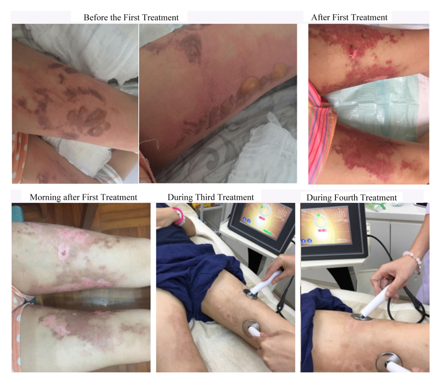
Figure 8. Second degree burn; healing progress from the 1^{\text{st}} to the 4^{\text{th}} treatment.