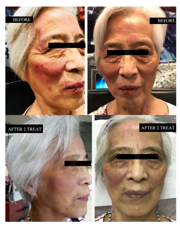
Figure 7. Herpes Zoster before and after two treatments.