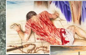
Messiah THE HEALER

By His Strips, we are healed. - Isaiah 53:5