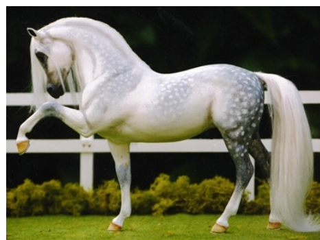
RESERVE CHAMPION SPANISH BREED: PR ELDORADO SPANISH ROSE (JV)

American Saddlebred (24): 1-Sultan of Swing (JC), 2-TS Missy Brown (MP), 3-TS Equinox (MP), 4-MN Jackie O (HC), 5-Divine Miss M (CR), 6-TS Cenozoic Silver Morning Glory (MP), 7-TS Autumn Dancer (MP), 8-Keepsake (HC), 9-RythmMaster (HC), 10-TS Pleistocene (MP)