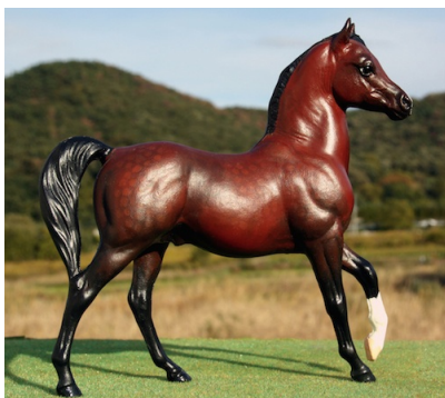
RES. CHAMPION BASE COLOR: ASAKURA CONDOR (AC)

Dapple Grey (19): 1-Attn Evildoers (AC), 2-Sasaki (AC), 3-Winds of Change (CH), 4-*Rebel Bint Sahra (CH), 5-Millennium Falcon (AC), 6-Follow The Moonlight (AC), 7-Disco Par T (IC), 8-Wickenden Osprey (AC), 9-*Quest (AC), 10-Ibn Hotep (SSSt)