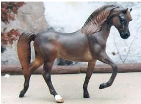
RESERVE CHAMPION REPAINT: MAXIMUM DOMINATION (IC)

Repaint w/Hair M/T: Trad. or Larger (42): 1-PR Eldorado Spanish Rose (JV), 2-GGK Tiqatu (SN), 3-Golden Malicious (SM), 4-Butterfly Kiss (JV), 5-PR Nazeem Al-Ashab (JV), 6-RumbleRex (SM), 7-Poco Reina (NF), 8-Atragon (AC), 9-TS Picante (MP), 10-TS Galilean Dragoness (MP)