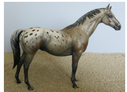
CHAMPION PATTERNED COLOR: SAGE WIND (CH)

Other Pinto Pattern (12): 1-The Pied Viper (AC), 2-Melulu (CV), 3-Tejas Treasure (VM), 4-Triton Too (SSSt), 5-Polaris (SSSt), 6-Singing Grass (CV), 7-Jeet Kune Do (LD), 8-Maharajah (LD), 9-Jasper (VM), 10-Love Gun (AP)