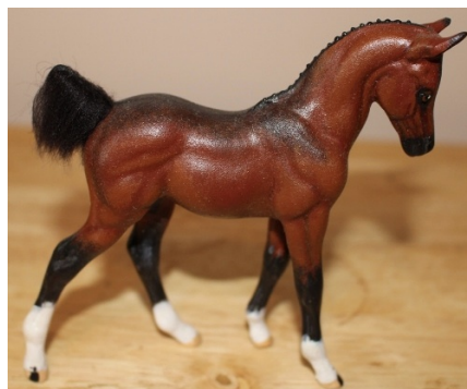
RESERVE CHAMPION FOAL: ANTARA APPALONIA (LB)

1980s BREED DIVISION OVERALL CHAMPION: JAMIL MHURATT (CR)