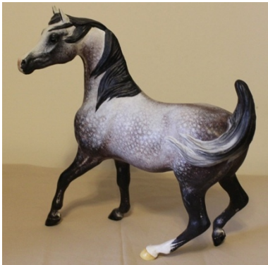
CHAMP GREY/ROAN: ARAHAEL (LB)

Roan (30): 1-J's Sweetbriar (AI), 2-Banned From Argo (AC), 3-KT Continental Rose (CM), 4-Hancock's Boondocs Blues (JV), 5-Moonlight Lady (HC), 6-Ladies' Delight (AP), 7-Justy (AC), 8-Stormaway Diamond (AC), 9-Go Varian (AC), 10-The Mad Cookie (CV)