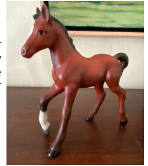
EBay, March 2021: Maine seller down-dogz's Lefton Foal CM by unknown artist, believed to be in the 1970s, auctioned to unknown buyer for $10.00.