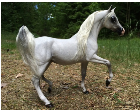
RESERVE CHAMPION GREY/ROAN: SHANYA (SN)

Palomino (24): 1-Tony Harken (AC), 2-SKS Aristo Khat (CM), 3-Diamond Sunseeker (ShR), 4-Ka Hank (ShR), 5-Ima Gold Nugget (CM), 6-Antara RM Starbird (AC), 7-Goldwillow (AC), 8-Hero's Medallion (SSu), 9-Vanye (AC), 10-Fiesta Jones (LB)