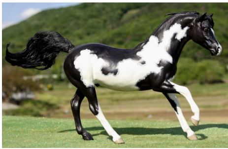
RESERVE CHAMPION SIMPLE REMAKE/REPAINT/HAIR OR SCULPTED MANE/TAIL: THE PIED VIPER (AC)

Major Rem. & Rep. w/Hair M/T: Trad. or Larger (11): 1-Indiana Jones (LB), 2-Wickenden Osprey (AC), 3-Rocking Chair Renegade Revel (CM), 4-Jokers Dice (AC), 5-Melulu (CV), 6-Telemann (LB), 7-*Quest (AC), 8-Brookridge Diamond (LB), 9-Penny Arcade (BP), 10-Diamond Legacy (SSu)