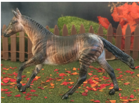
RESERVE CHAMPION LONGEAR/EXOTIC/ FANTASY: IMAGINE THAT (ShR)

Stock Breed Foal (36): 1-Meadow Star (HC), 2-Class Action (CM), 3-KT Continental Rose (CM), 4-Tawny Wardlaw (LB), 5-Little Smoky (CF), 6-Lone Star Too (CV), 7-Northwind Whistlestop (VM), 8-Peppy Playboy (CS), 9-Bean Bandit (AC), 10-Cinnamon Cody (LB)