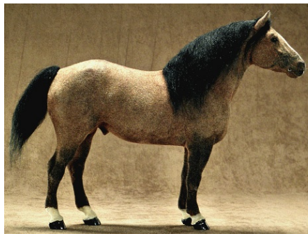
Lady Jessica (CV), 6-Black Hand (CV), 7-Lady Red Diamond (AP)

European Pony (5): 1-Eagle Sharp (AC), 2-Hi Ho Hastings (LB), 3-Wicken-den Osprey (AC), 4-Strawberry Wine (SSt), 5-Shales Commander (IC)