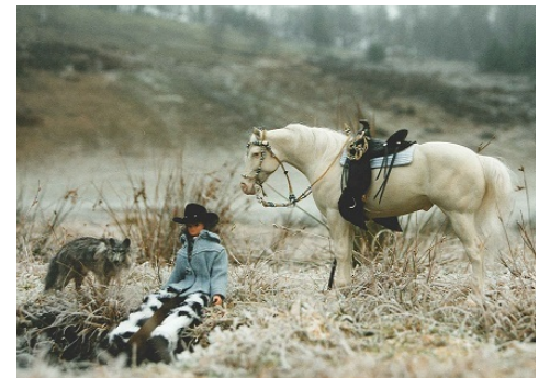
Scenes: Digital & 35mm Photo (8): 1-LBR The Pinkeyed Stallion: Frozen Prairie (RN), 2-LBR Kybele: Visiting Marbach (RN), 3-Alamitos Ridge: Ride with Jace (RN), 4-LBR The Pinkeyed Stallion: Winter Prairie (RN), 5-Bluegrass Freckles: Cow Work (RN), 6-Lacy Lady and Star Shine (JW), 7-Sheba and Rosa Luna Sangrienta (JW), 8-Carousel (HC)