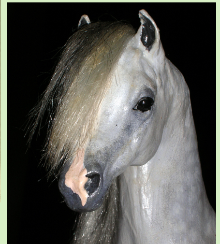
RM Inara 40 Years Old