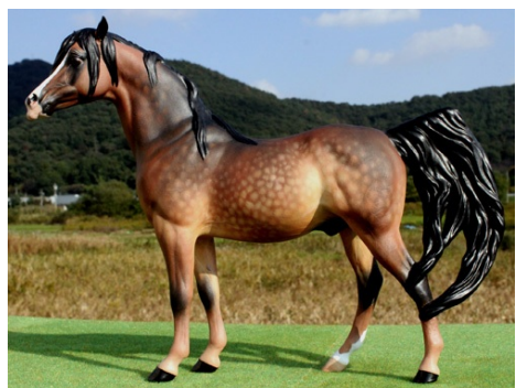
RESERVE CHAMPION LIGHT BREED: SHIRAMBA KAMUI (AC)

Thoroughbred (37): 1-Claudia (SN), 2-Half A Shadow (SN), 3-Waltzing Matilda (AC), 4-Temple Lord (SN), 5-Rikiishi (AC), 6-Royal Torriatte (LK), 7-Katana (SN), 8-Cry Dream (SN), 9-Brimstone (JC), 10-Highwayinthewind (AC)