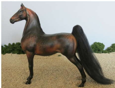
CHAMPION GAITED BREED: DARK COMMANDER (CH)

Mr. Majestic (SSSt), 2-Wicked Speedia (AC), 3-Taxi Dancer (SSu), 4-Quaint Keaton (AC), 5-AMB Midnight Frosty (AC), 6-Flashdancer (AC), 7-BD Moonlight Night Shade (HC), 8-Wings of Magic (AC)