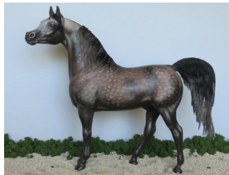
RES. CHAMPION LIGHT BREED: *THE RAISULI (CH)

Thoroughbred (12): 1-Attn Evildoers (AC), 2-Winds of Change (CH), 3-Seventh Moon (AC), 4-Seaside Rendezvous (LK), 5-Frostfang (KW), 6-Teo Torriatte (LK), 7-Penny Arcade (BP), 8-Be A Hero (AC), 9-Imagineer (AC), 10-Minstrel's Joy (AP)