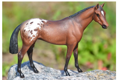
RESERVE CHAMPION REPAINT/HAIR OR SCULPTED MANE/TAIL: I'M IMPRESSED (SN)

Simple Remake & Repaint w/Hair M/T: Traditional or Larger (84): 1-Walad (SN), 2-TS Dragon Knight (MP), 3-Ahvaz Wahaana (SN), 4-Amantus VS (SN), 5-Briefcase Fulla Blues (AC), 6-Raindrops Socks Fancy (SN), 7-Red Rebel (SSU),