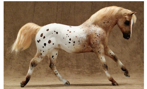
RES. CHAMPION EXTREME REMAKE/REPAINT/HAIR OR SCULPTED MANE/ TAIL: DIAMOND PLAYTIME (CM)

Flocked w/Flocked Mane/Tail (2): 1-Moment In Time (CV), 2-Banshee (LD)