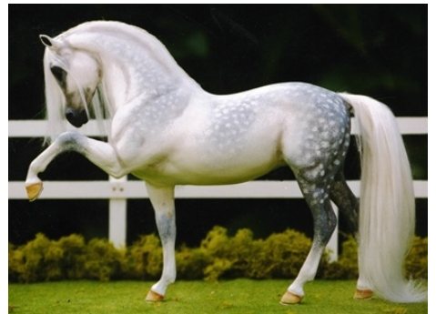
CHAMPION REPAINT/HAIR OR SCULPTED MANE/TAIL: PR ELDORADO SPANISH ROSE (JV)

Repaint w/Non-Hair M/T: Smaller than Classic (11): 1-I'm Impressed (SN), 2-Bint Amira (CV), 3-Harmonium (LK), 4-MN Jackie O (HC), 5-Romeo (CR), 6-London Fog (LK), 7-CL Fairway (HC), 8-Kitty Sonata (IC), 9-Titan (IC), 10-Frosted Gold (CR)