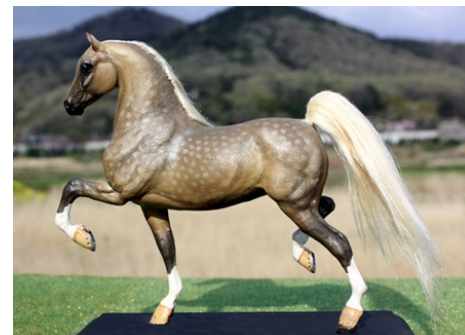
CHAMPION PONY/MINIATURE HORSE: PENNY DREADFUL (AC)

Other Pure or Mixed Pony Breed (10): 1-Althea (ShR), 2-Tug Hill Minstrel (CM), 3-Big Bang Theory (ShR), 4-Tug Hill Pied Piper (CM), 5-Dante's Infirno (HC), 6-Ravi Stones (CV), 7-Southern Cross (CM), 8-Parkland Spartan (SH), 9-The Country Girl (LK), 10-Twylands Coral Sea (SH)