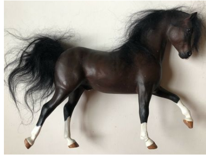
EBay, Feb. 2021: Georgia seller rideablackzwan's Breyer Traditional Black Stallion CM by unknown artist (filler lifting) believed to be in the 1990s, auctioned to unknown buyer for $89.00.