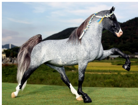
RESERVE CHAMPION GAITED BREED: BRIEFCASE FULLA BLUES (AC)

Clydesdale/Shire (17): 1-Sparrowood Rob Roy (SSu), 2-TS Bonnie Red (MP), 3-Deloyer Starblazer (AC), 4-WG Kenny (HC), 5-Amazing Heart (SN), 6-RM Nuclear Winter (KW), 7-RAS Elian Demoiselle (CM), 8-Rumneyhill Victoria (SN), 9-TS Annie Red (MP), 10-Deloyer Donald (AC)