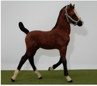
1960s/1970s WORKMANSHIP DIV. OVERALL CHAMPION: *THE RAI-SULI (CH)