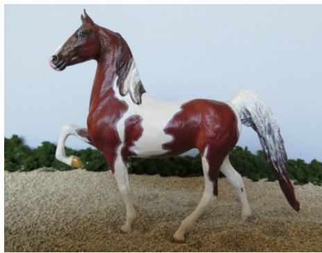
RES. CHAMPION CUSTOM W/FACTORY PAINT: LOVE N' FLAMES (CH)

Repaint: Trad. or Larger (49): 1-Arahael (LB), 2-Loftus Jones (LB), 3-Crescent Coral (AC), 4-Red Tribution (AC), 5-Seven S Rebel (LB), 6-Skartaris (CH), 7-Nyx (AC), 8-Hobo's Lullaby (AC), 9-Love Letters (LB), 10-Montana Cat (LB)