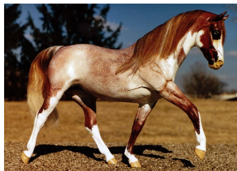
RES. CHAMPION GAITED BREED: CHIRIN'S BELL (AC)

Clydesdale/Shire (17): 1-Brigante (AC), 2-Dominion Blue Douglas (SSu), 3-Megazone Eve (AC), 4-Thunder in Paradise (AC), 5-Cedar Hill Duncan (VM), 6-Royal Witch (AP), 7-Sparrowood Beauty (SSu), 8-Foxcroft Lad (LK), 9-Diamond Blue Rose (CR), 10-Barron's Burdon Belle (JV)