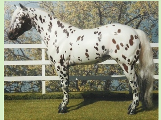
Poco Dot 30 Years Old!

(Have one created in 1961, 1966, 1971, 1976, 1981, 1986, 1991, or 1996? Get it into the Birthday Barn spotlight by e-mailing its photo and info to our Gmail address below!)