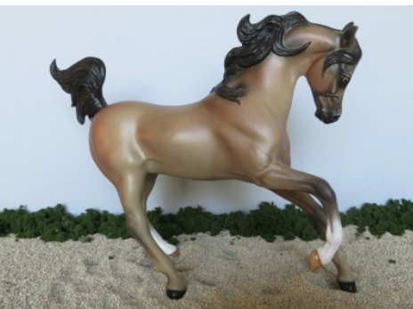
RESERVE CHAMPION CUSTOM WITH FACTORY PAINT: GHANISSA EM (CH)

Repaint: Traditional or Larger (36): 1-Asuka Ryo (AC), 2-*Koment (SSt), 3-Llaqtaymanta (SN), 4-Jedi Moon (AI), 5-Brimstone (JC), 6-Burning Memory (CV), 7-Breezen (AI), 8-Blue Silk Rose (IC), 9-Come Fly With Me (CC), 10-Racing the Sun (BP)