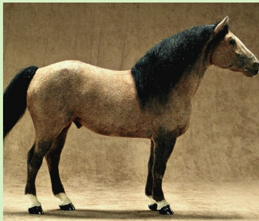
Tug Hill By Request 45 Years Old!