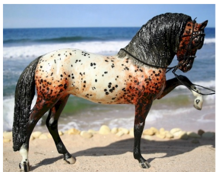
RESERVE CHAMPION SPANISH BREED: TS ALUVAME SUNSPOTS (MP)

ASB (31): 1-Dark Commander (CH), 2-Rocket Gibraltar (CV), 3-Isaac Godunov (CV), 4-Avalanche (CV), 5-Iron Butterfly (AC), 6-Black Tie Affair (SSSt), 7-Slamdunk Diamond (AC), 8-Love N' Flames (CH), 9-Crimson Queen (ShR), 10-Prince of Denmark (SSSt)