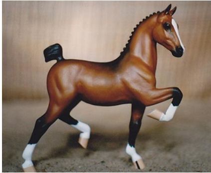
RES. CHAMPION EXTREME REMAKE/REPAINT/HAIR OR SCULPTED M/T: CLOCKWORK (LaD)