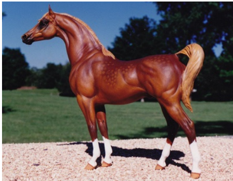
CHAMPION REPAINT: ASUKA RYO (AC)

Repaint: Smaller than Classic (46): 1-Maximum Domination (IC), 2-Tootsie (HC), 3-Jeral (SN), 4-Spoiler (RN), 5-Hip Hop Fly Away (IC), 6-Blackberry Lane Notorious (ShR), 7-*Astor (SSt), 8-Keepsake (HC), 9-Hoop De Do (IC), 10-Kentucky Belle (CR)