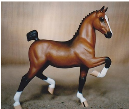
RESERVE CHAMPION PONY/MINIATURE HORSE: CLOCKWORK (LaD)

Longear (7): 1-Belle Kabong (AC), 2-Ironwood Glenn (SSt), 3-So Molson Canadien (SSu), 4-Gallimaufry (SSu), 5-Gentleman John (BH), 6-Pam-mule-a (KW), 7-Bob (SSu)