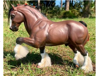
Facebook group Vintage Custom Model Horse Sale/Trade/Wanted, March 2021: seller Heather Strumolo's Breyer Clydesdale Stallion CM by Sue Guffey in the 1990s (cracked epoxy), sold to Sparky C. for best offer of $100.00.