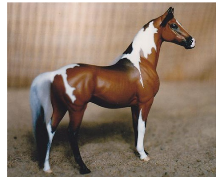
RESERVE CHAMPION PATTERNED COLOR: SPARTACUS (LaD)

Longear/Exotic (10): 1-Imagine That (ShR), 2-Belle Kabong (AC), 3-J's Dandy-lion (AI), 4-J's Tiger Lily (AI), 5-Pam-mule-a (KW), 6-So Molson Canadien (SSu), 7-Gallimaufry (SSu), 8-Gentleman John (BH), 9-Ironwood Glenn (SSt), 10-Bob (SSu)