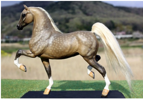
CHAMPION OTHER COLOR: PENNY DREADFUL (AC)