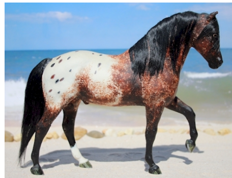
CHAMPION SPANISH BREED: TS PICANTE (MP)

Other Pure or Mixed Spanish Breed (12): 1-TS Picante (MP), 2-RM Sophiia (CV), 3-Ice Queen (AI), 4-KT Danza De Oura (CM), 5-Lucullian (HC), 6-Elusive Vision (SSSt), 7-Malegena (CM), 8-Encaje (SSSt), 9-Siglavy Seiko (CV), 10-PR Bosanova Brief Encounter (JV)