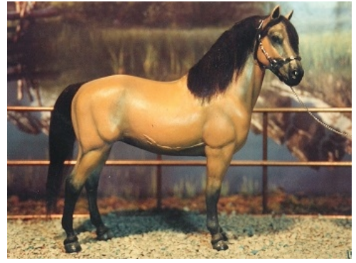
(SSu), 7-Mountain Knight (CC), 8-Sweet William J (CM), 9-Riff Raff (SSu), 10-Witchita Rock (CM)