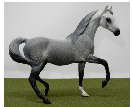
10-Lover (CV), 10-Fiesta Jones (LB)

Repaint with Hair M/T: Trad. or Larger (79): 1-Mon'Nafa Rani (CR), 2-TS Elegant Gypsy (MP), 3-Sadamebius (AC), 4-TS Adirondack (MP), 5-TS Vesuvius (MP), 6-*Nabour (CV), 7-Clash Game (AC), 8-DQ Storm Warning (SSt), 9-Phantom