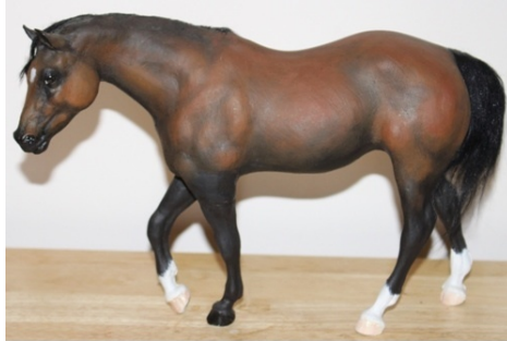
RES. CHAMPION MAJOR REMAKE/REPAINT/HAIR OR SCULPTED M/T: INDIANA JONES (LB)

Extreme Rem. & Rep. w/Hair M/T: Trad. or Larger (15): 1-Kandu Koho (AC), 2-Rockledge Diamond Lark (CM), 3-Diamond Seonee (AC), 4-Diamond Flame (SSu), 5-Diamond Handsome Devil (BH), 6-DQ Dragon Questor (BP), 7-Brookridge Diamond II (AP), 8- Diamond Fancy Cat (CM), 9-SD Conversano Diamond (AP), 10-RM Bay Bandit (AP)