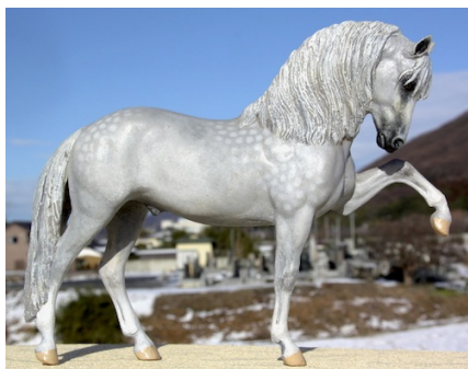
Phoenix (AC), 2-Carnival King (LB), 3-Cindy Lou Who (AP)

Tennessee Walking Horse (1): 1-Merry Mountain Mist (APo)