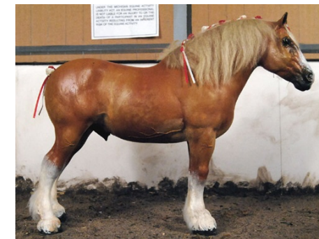
BILLFAR DU MARAIS (SSu)

American Pony (29): 1-Penny Dreadful (AC), 2-Confederate Gray (LB), 3-Firefly (CV), 4-Zip's Silver Lining (CM), 5-Lambchop (LaD), 6-Kiwi (LaD), 7-Juliette (HC), 8-Empire's Fudge Sundae (CM), 9-Go Varian (AC), 10-TS Sheldon (MP)