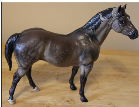
RESERVE CHAMPION CREAM/DUN COLOR: CONFEDERATE GRAY (LB)

Blanket Appaloosa (59): 1-Flammable Jammies (AC), 2-TS Adirondack (MP), 3-Clash Game (AC), 4-Bang Ippongi (AC), 5-Waters Under Earth (CV), 6-TS Vesuvius (MP), 7-Murphy's Law (AP), 8-Montana Cat (LB), 9-J's Enchanted Ecco (AI), 10-Mighty Bright J (AI)