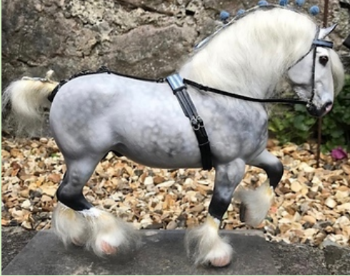
Foxcroft Lad 35 Years Old!