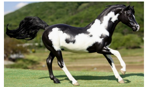
CHAMPION SPANISH BREED: THE PIED VIPER (AC)

Other Pure/Mix Spanish (2): 1-The Pied Viper (AC), 2-SD Conversano Diamond (AP)