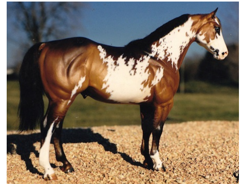
CHAMPION STOCK BREED: MARS FLASH (AC)

DO Dun IV (JV), 5-Tug Hill Pokey Dott (CM), 6-TS Kinzua River (CV), 7-Ruby Tuesday (ShR), 8-Ginger Snap (JW)