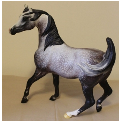
CHAMPION REPAINT: ARAHAEL (LB)

Repaint: Smaller than Classic (18): 1-Khrystal Music (CH), 2-Ravyn (SSt), 3-En Fuego (CR), 4-Banned From Argo (AC), 5-Big Bang Theory (ShR), 6-Evenstar (ShR), 7-Amarna Quimar (MW), 8-Charisma (CC), 9-Dexi's Midnight Runner (SSu), 10-Bito Babe (AC)