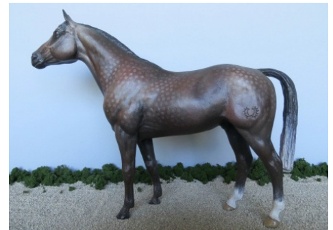
RES. CHAMP SPORT: KORSAKOV (CH)

Paso Fino/Peruvian Paso (1): 1-Trigger Mortis (AC)