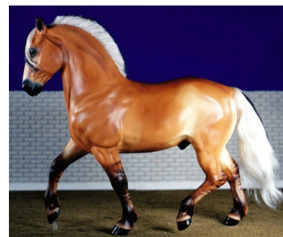
RESERVE CHAMPION PONY/MINI HORSE: ABRAXAS (AC)

Longear (23): 1-Jeb (SSu), 2-Rebel Yell (RN), 3-Tulpe (HC), 4-Alter Ego (ShR), 5-Cutacross Shorty (SSu), 6-Take My Picture (IC), 7-W-A-V Sebastian (LiD), 8-Shamrock Elfin Magic (SSt), 9-DA Bardigano Honest John (JV), 10-MN Elwood Blues (RN)