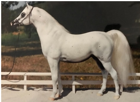
Mares (10): 1-Wahaana (SN), 2-Ar Tayet (SN), 3-Sun's Only For You (SN), 4-Nayef (SN), 5-Lady Glade (IC), 6-DQ Shi-away Jetta (CM), 7-Romana (SSu), 8-Lonesome Dove (CM), 9-Sherwood Peacock (CM), 10-The Iron Madam (IC)