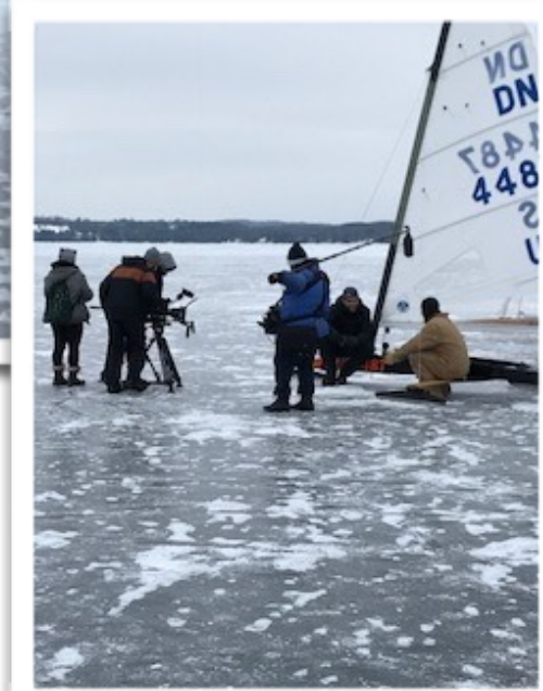
NORTH AMERICAN DN CHAMPIONSHIPS