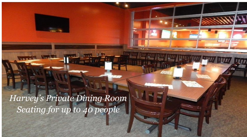
Harvey's Private Dining Room Seating for up to 40 people

~ Host Tab – Open bar, we will add it all up if you do not wish to have tickets.