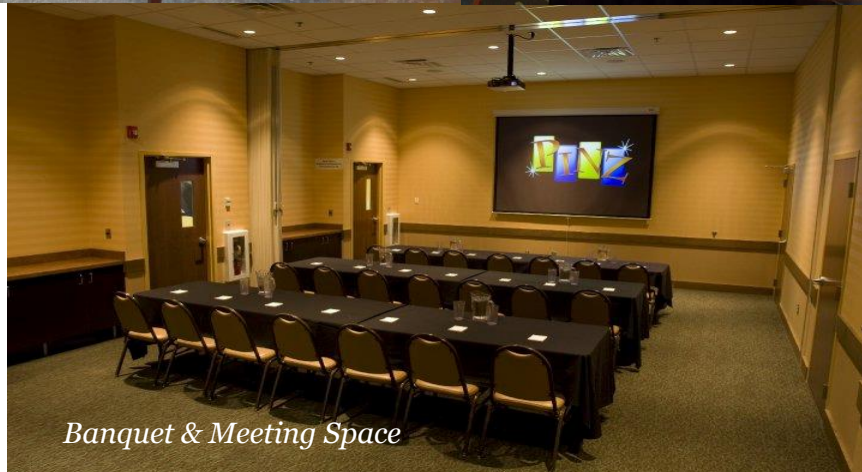
Banquet & Meeting Space