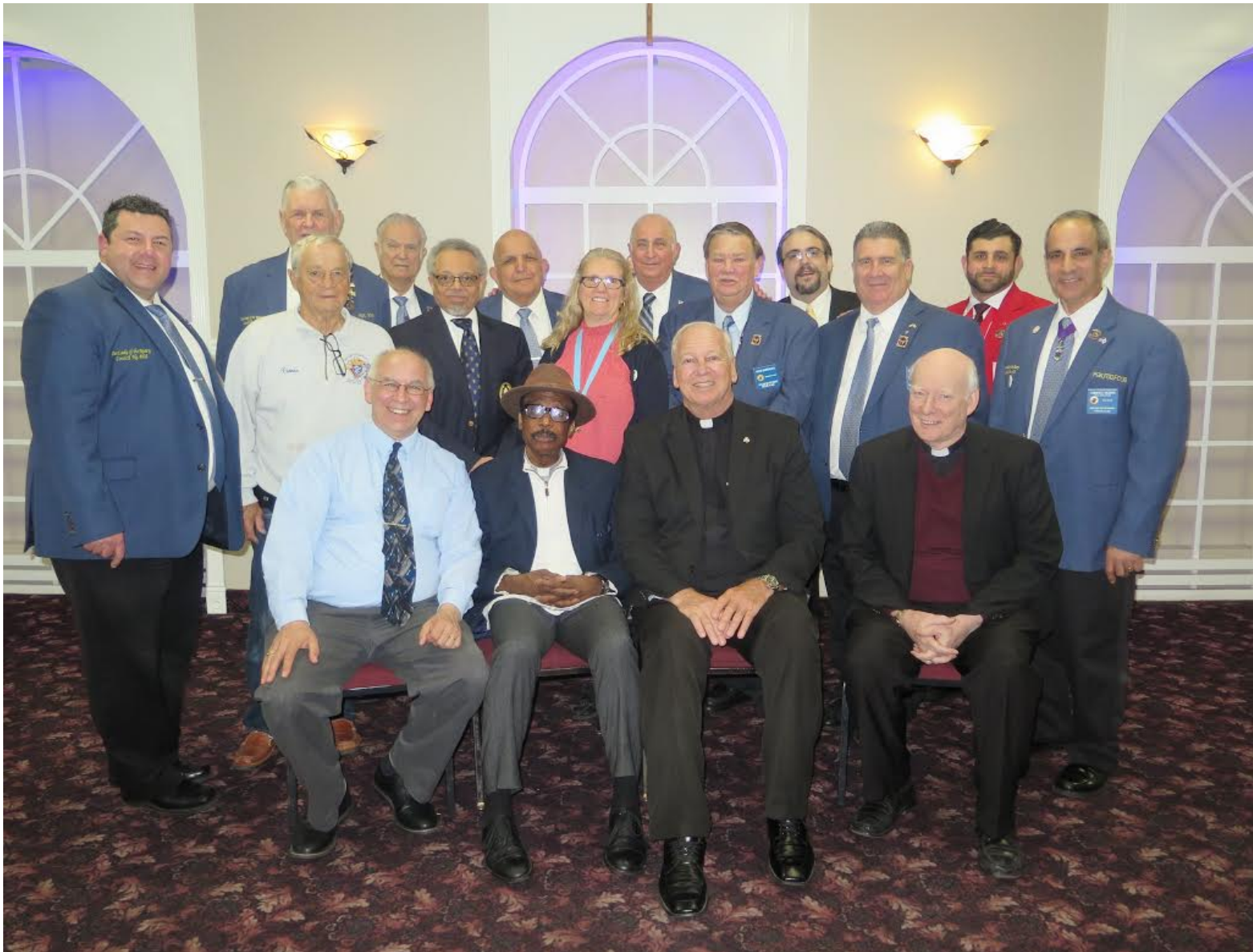
Picture from Clergy Night

$15.00 per person – no tickets sold at door