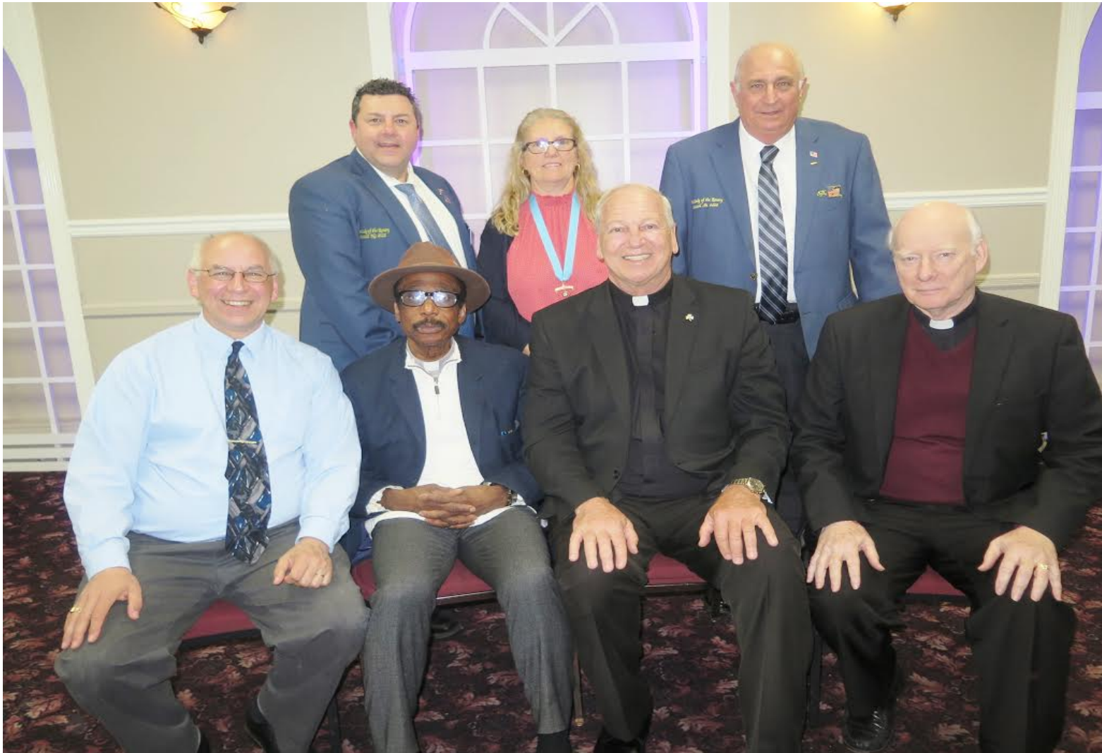
Picture From Clergy Night