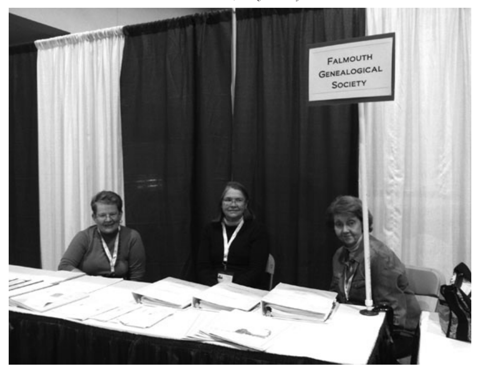
Members of Falmouth Genealogical Society man the hospitality table at NERGC