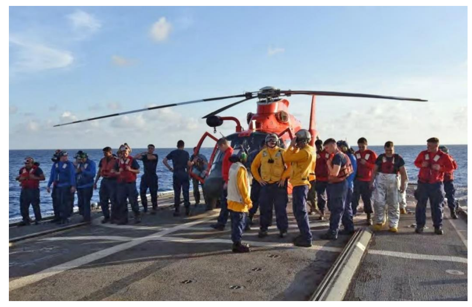
NORTHLAND crewmembers conducting safety walk downs prior to a helicopter evolution.