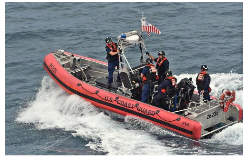
NORTHLAND Crewmembers conducting a training evolution onboard the cutter's OTH-IV small boat.

Very Respectfully, XO LCDR Elizabeth Tufts