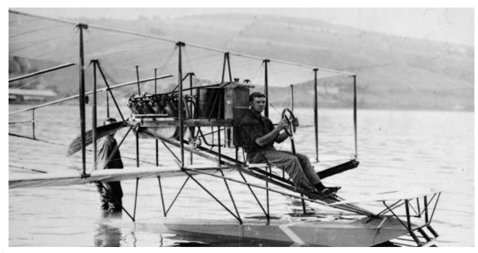
Ellyson Hydro Testing - 1911

THEODORE G. ELLYSON was designated by the Department of the Navy, Air Pilot No. 1, NAVY AIR PILOT on January 1, 1914.