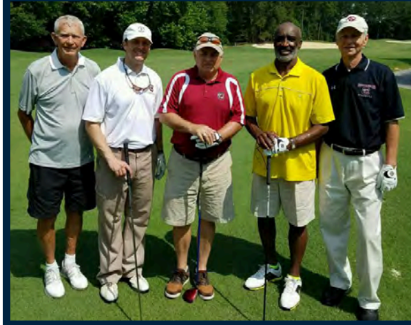
Spring Golf Tournament