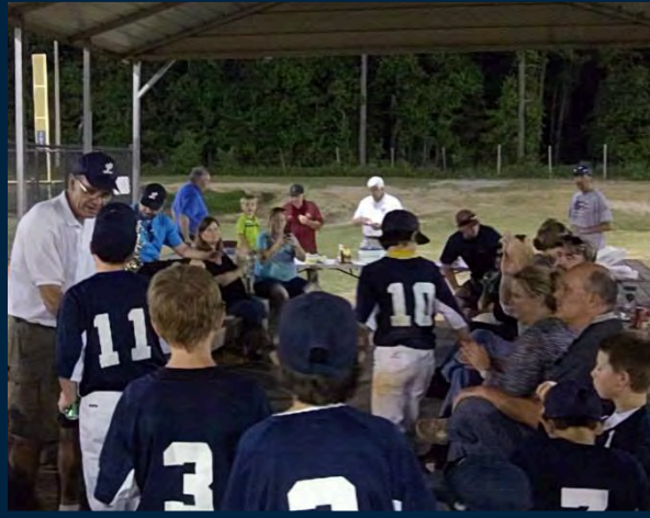
Dixie Youth Baseball Team