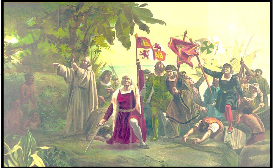
First landing of Columbus on the shores of the New World, at San Salvador, W.I., Oct. 12th 1492 , Dióscoro Teófilo Puebla Tolín