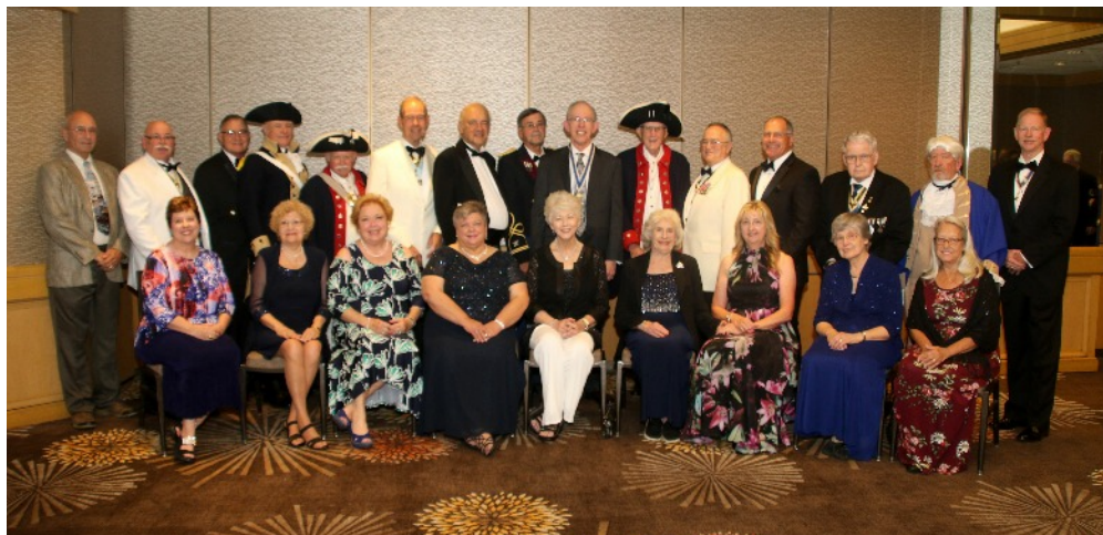
What a great Arizona turnout this year