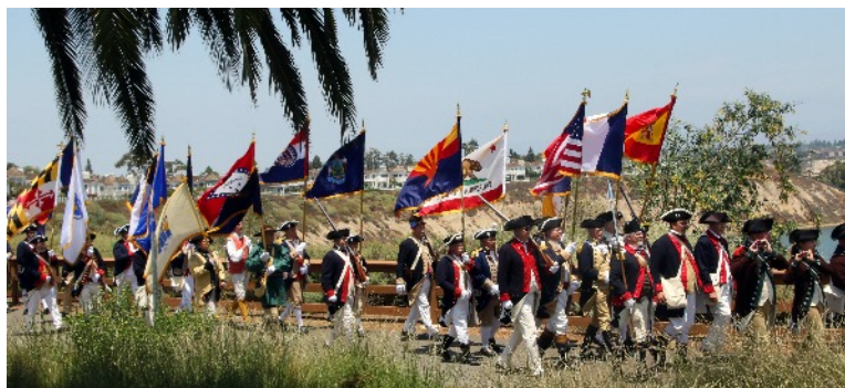
National CG marches to Castaways Park