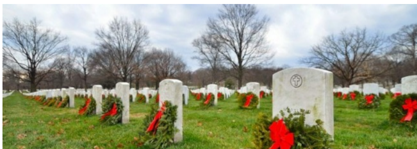
Wreaths Across America December 14, 2019

The Prescott Chapter is committed to Wreaths Across America and will have a program to be announced at the next meeting. Work with us to help our National Cemetery place a wreath on every grave this year.