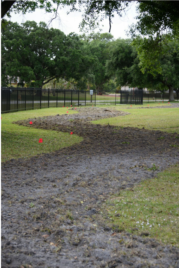
Walking trail being shaped along perimeter of property.