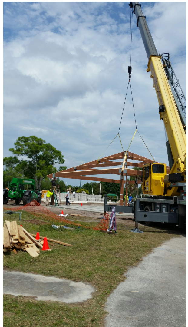
The roof is being raised on the Grace Pavilion.