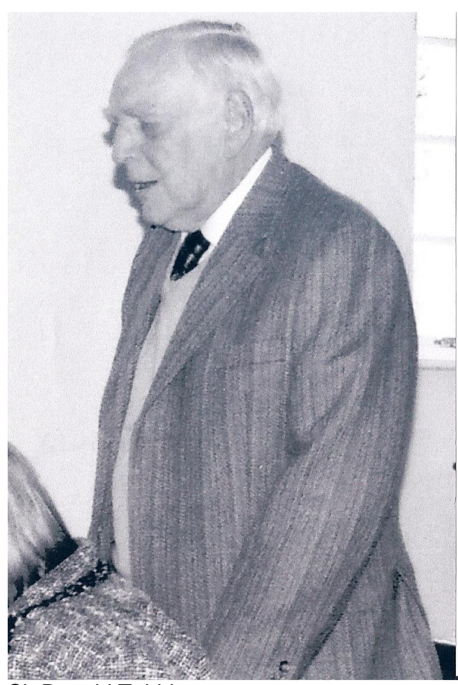
Sir Donald Tebbit