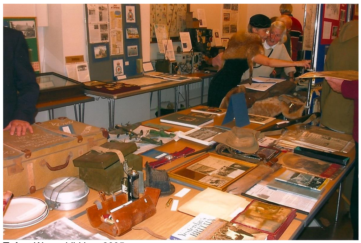
Toft at War exhibition 2005