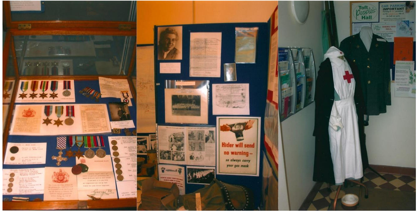
Medals display VAD and GI uniforms