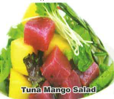
Tuna Mango Salad