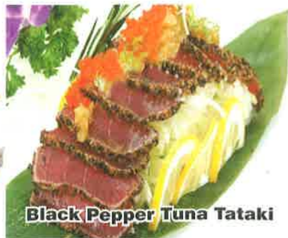
Black Pepper Tuna Tataki