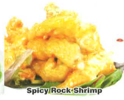
Spicy Rock Shrimp