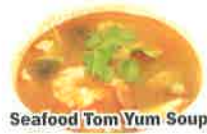
Seafood Tom Yum Soup