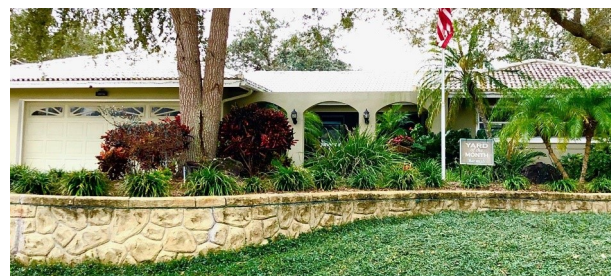
December 2018 Yard of the Month on Bay Hills Dr

YARD OF THE MONTH NOTE: Because the old YOM sign deteriorated so badly, the awards have been suspended until a new sign is prepared. The new sign will incorporate art work from the new entry sign faces when they are in place.