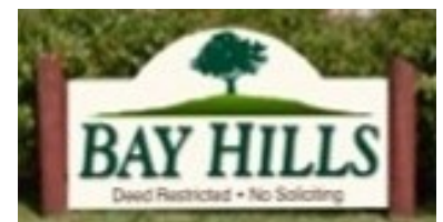
"SOON" we all hope