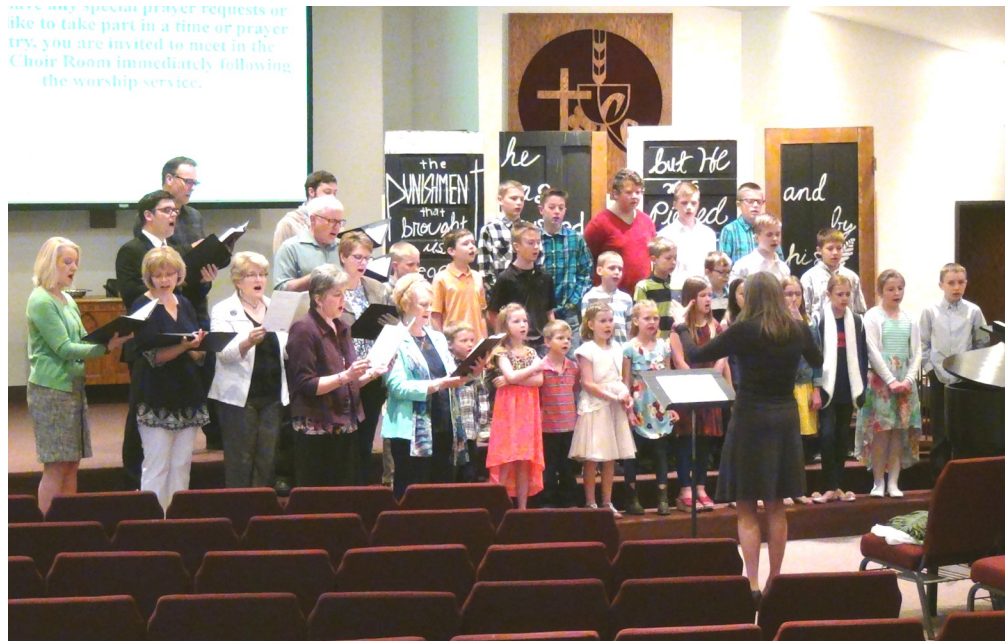
The Junior Choir (grades K-6) joined the Senior Choir to sing on Palm Sunday. The choirs marched in waving palm branches as they traditionally do. They are shown above rehearsing before the Palm Sunday service.

For any special prayer requests or to take part in a time of prayer try, you are invited to meet in the Choir Room immediately following the worship service.