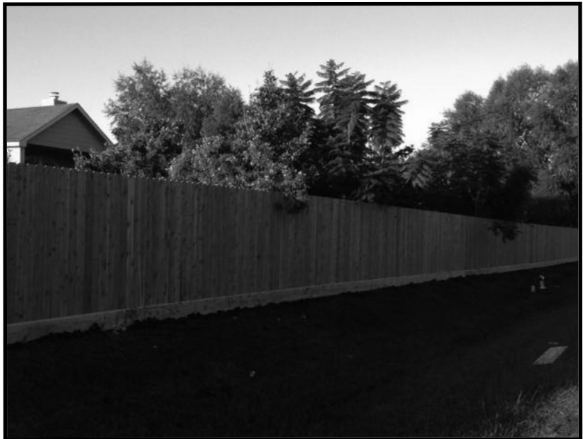
New fence on Florence 8ft.

This is the Burney fence which is still in need of repair. The vote to allow the HOA Board to replace the Burney Road fence with a construction loan has passed. Thank you to all that voted and made this possible. The Board will now start the process of selecting a bank to secure funding so this project can move forward.