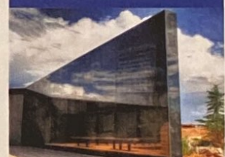
New Mexico Veterans' Memorial