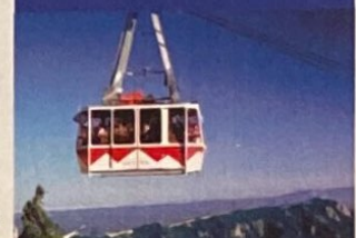
Breathtaking Views of the Sandia Mountains