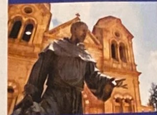
St Francis Cathedral in Santa Fe