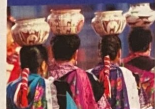
Native Southwestern Culture and Crafts