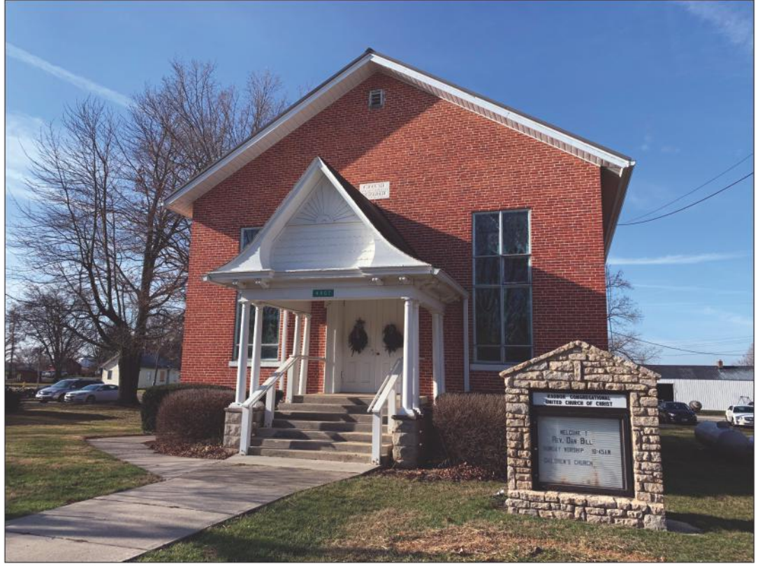
The façade of the Radnor Congregational Church from State Route 203.

In its early years, the preacher influential Benjamin Chidlaw, who was born in Bala, North Wales and grew up in Radnor, worshiped with the congregation. Originally Welsh-speaking, the church gradually changed over to the use of English in its services in order to retain the younger generations. According to the 105 year anniversary program from 1925, "The Welsh language was used exclusively until 1865 when English was