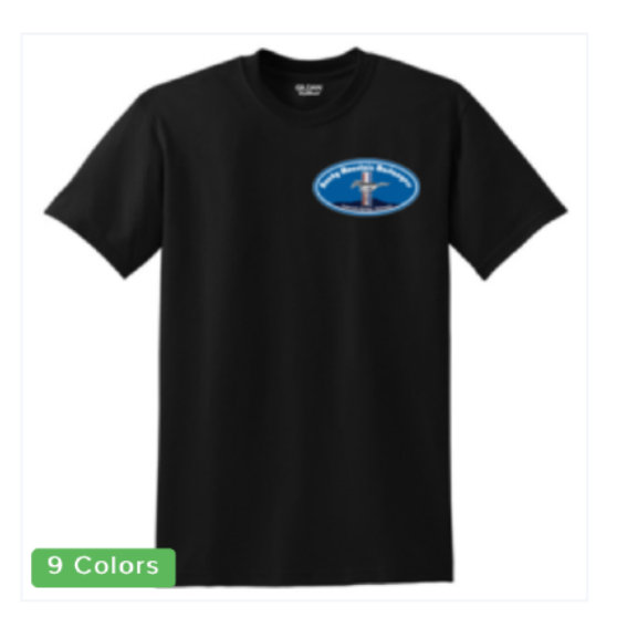
Gildan - DryBlend 50 Cotton/50 Poly T-Shirt $12.00