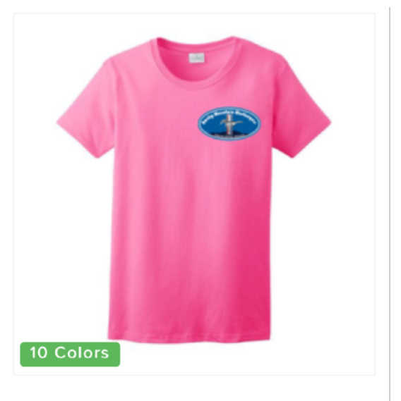
Gildan <sup>®</sup> - Ladies Ultra Cotton <sup>®</sup> 100% Cotton T-Shirt $12.00