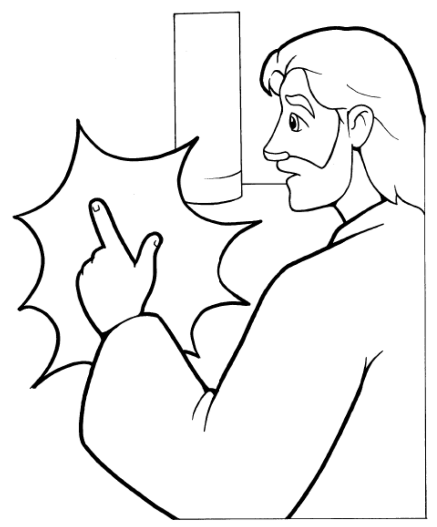
Jesus Appears to the Disciples