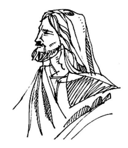
Copyright © Sermons4Kids, Inc. May be reproduced for Ministry Use