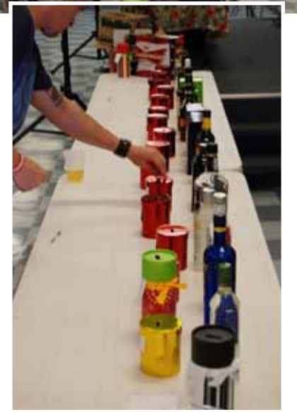
Putting in tickets on the raffle prizes is always a popular item. There's always a nice selction of liquors, tickets and passes to all sorts of restaurants and events. Generous donors and lucky winners come together one at a time with every withdrawal from the drawing box!