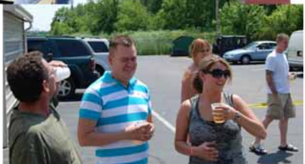
The banquet is a great afternoon of relaxing, talking and hanging out with friends.