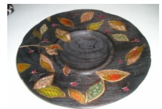
Monte Richards – dyed elm hollow form Myra Orton – quilts of autumn platter