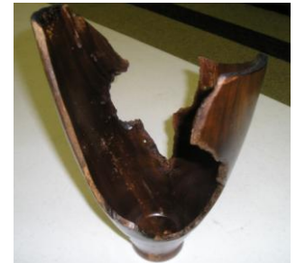
Jimmy Greenwood – cherry open form, Walnut open form