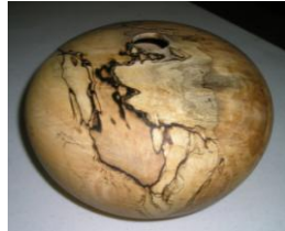
Ray Sandusky – walnut bowls, Sugar maple hollow form,