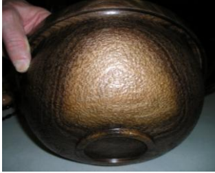
Fred Tacas – walnut bowl