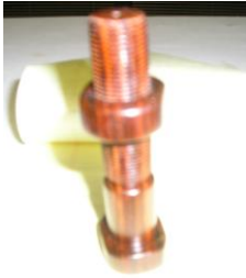
Don Thompson – maple ornament, Threaded nut and bolt