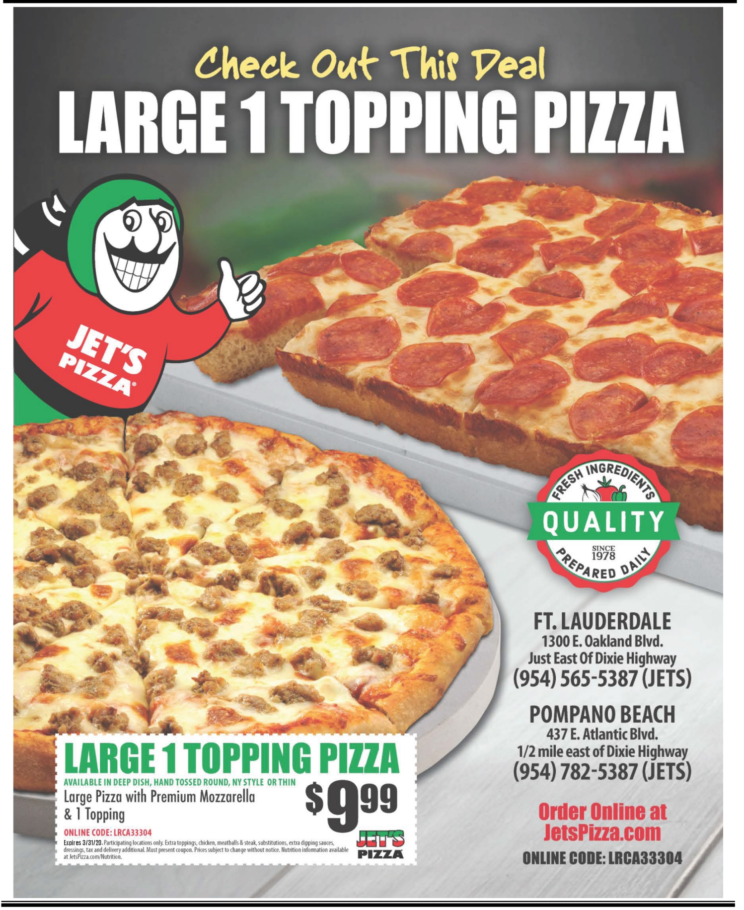
Page 12 — Spring 2020 Lake Ridge News