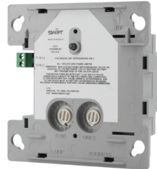
SWIFT Intelligent Wireless Modules