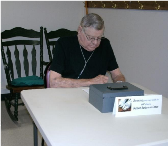
The Senior Center enjoyed a wonderful day at the Sweet Corn Festival. It was nice seeing so many people supporting the event and talking with all the individuals that showed support for our Senior Center and what we do for our seniors with their kind words. Thank you to our Board Members, Staff, and some very special members, that took time out of their day to help us with our pancake breakfast, and sat uptown to show their support.