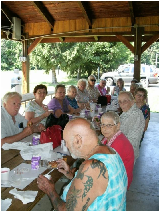
Seniors enjoying the day at the State Park. Everyone had lunch and played bingo.