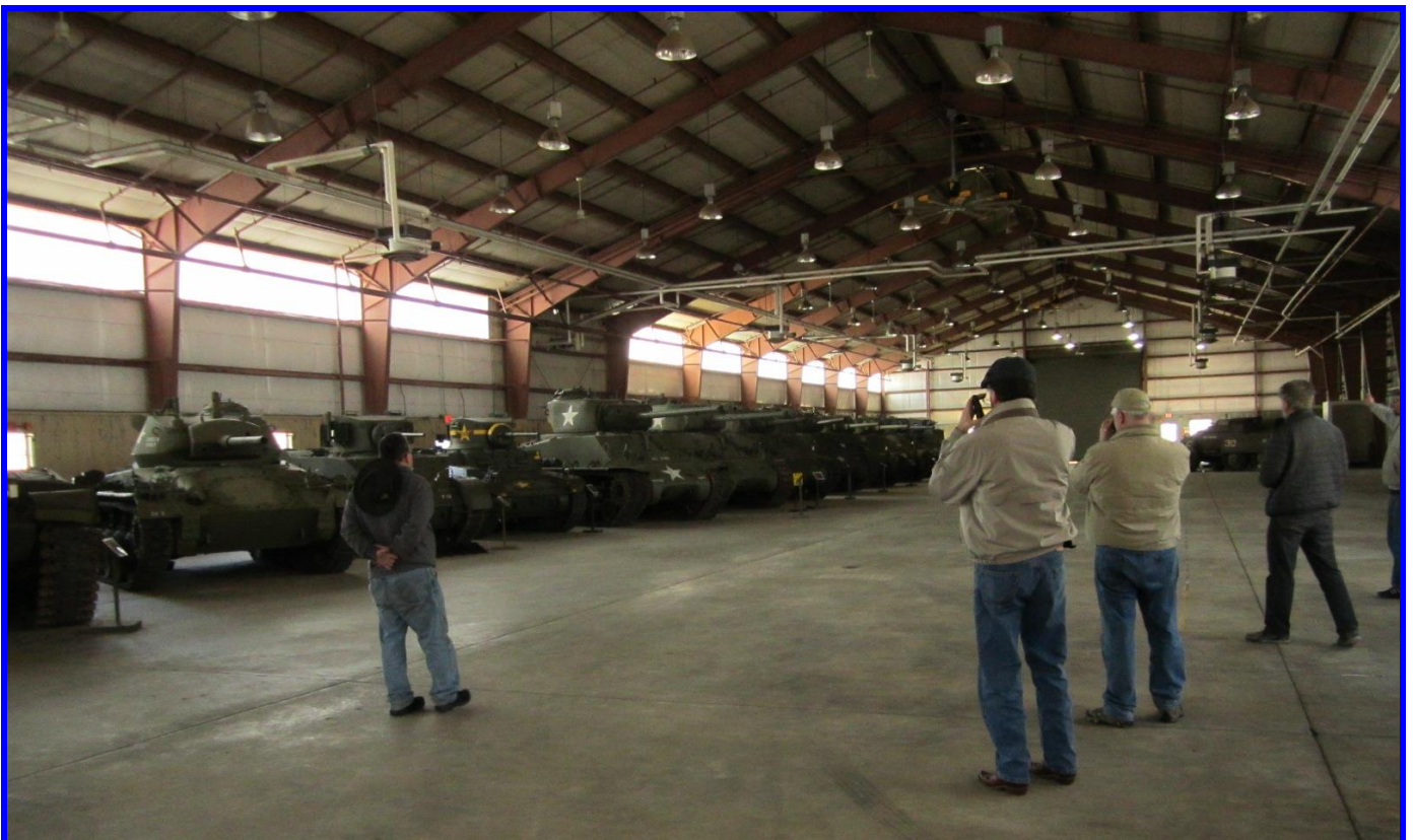
Inside the Sherman Tank Display Building