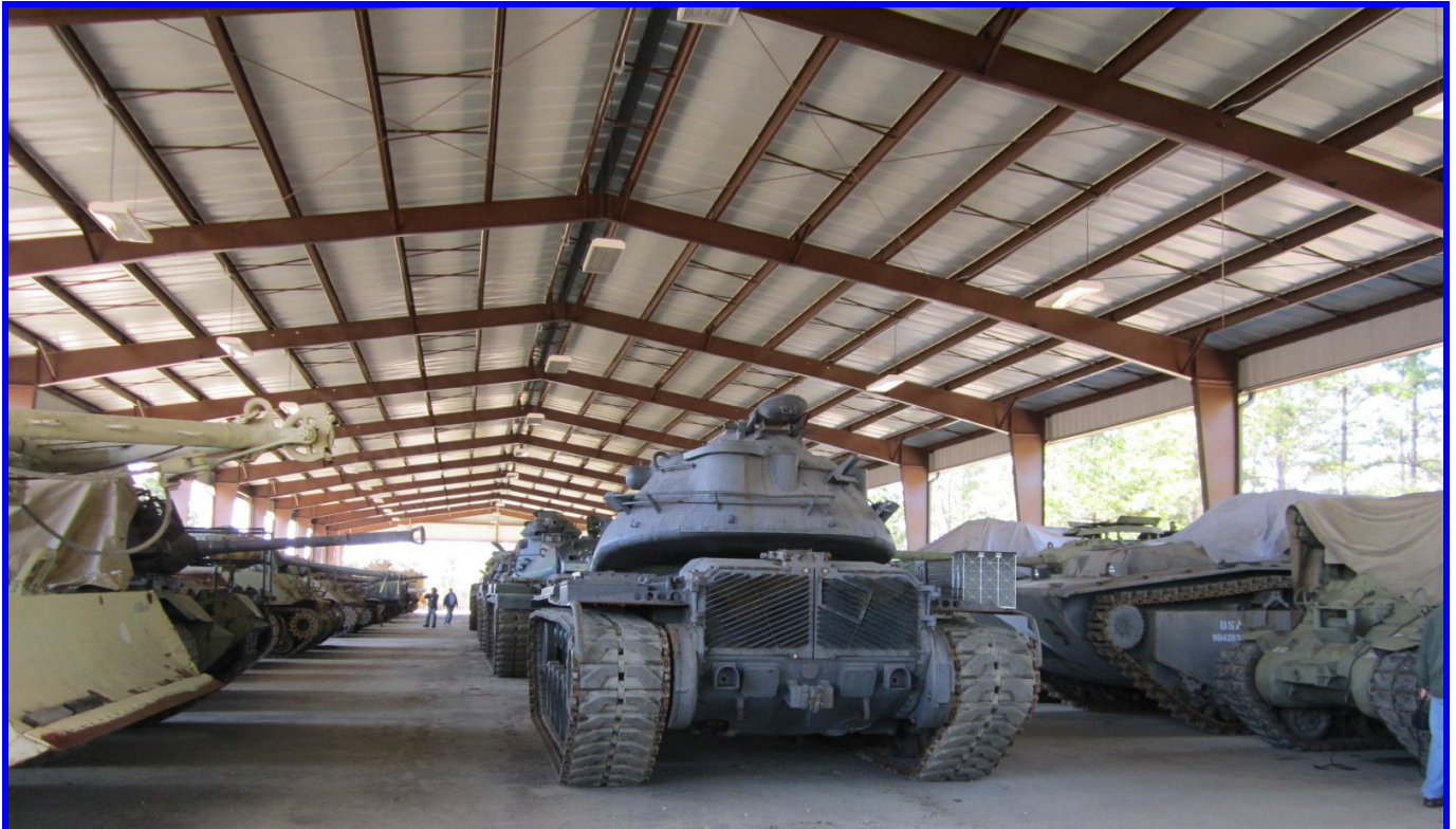
Outside Storage of various Tanks