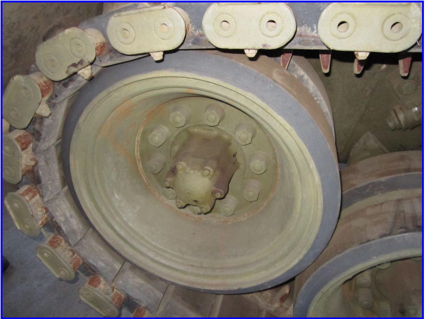
Sample Picture showing the Detail of a Road Wheel in the Collection