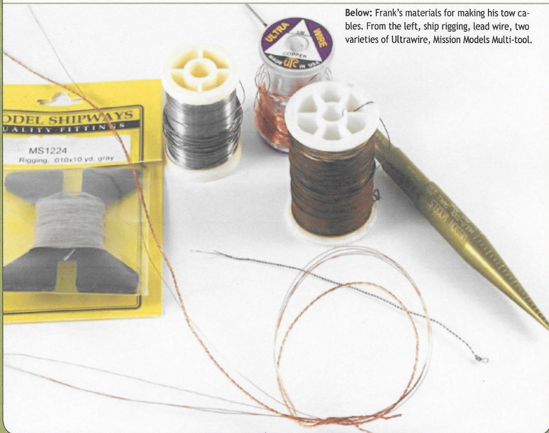
Below: Frank's materials for making his tow cables. From the left, ship rigging, lead wire, two varieties of Ultrawire, Mission Models Multi-tool.

The cable ends have an eyelet for attaching to the vehicle towing hooks. These patterns differ across armies and eras, so check your references. You can use pieces of tape or lead foil to help you form the cable ends to match what you need. It's interesting to note that the real tow cables are often coated in a grease preservative to repel moisture and prevent rust, but this means it attracts dust. Be aware of this when painting your home-grown cables. At all times avoid bright silver! A chemical called "Blacken-It" is useful to stain the wire cables before painting. This helps to prevent the paint from chipping off, but it's not foolproof. Art and craft stores also carry a liquid stain intended for stained glass work that works similarly to Blacken-It.