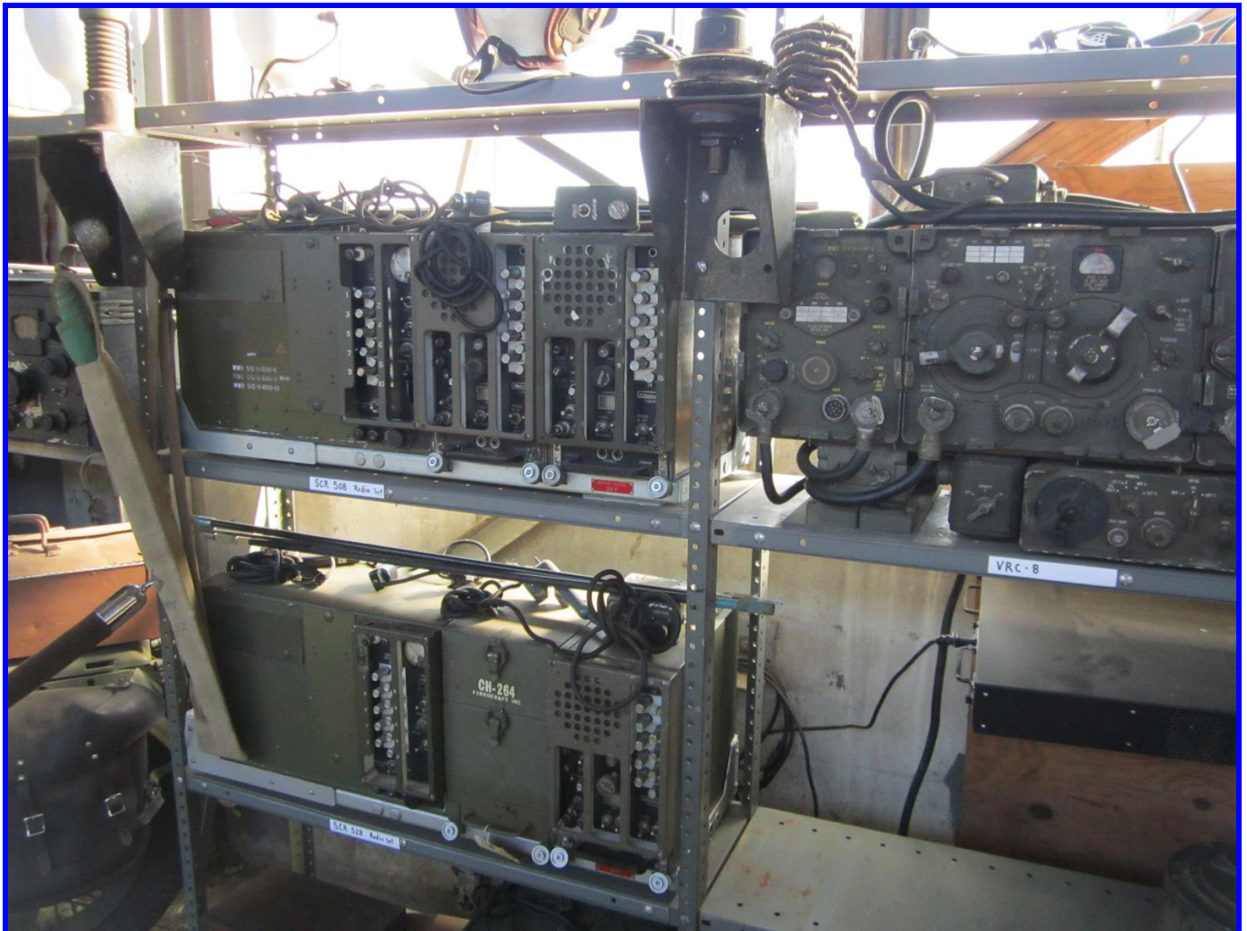
Radio Sets in the Collection