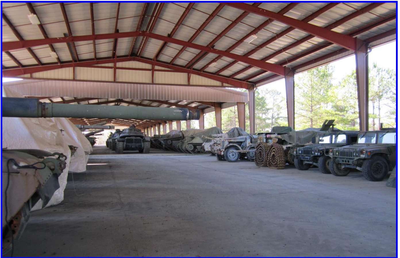
Outside Storage of various Tanks