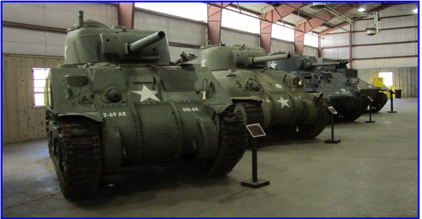
Inside the Sherman Tank Display Building