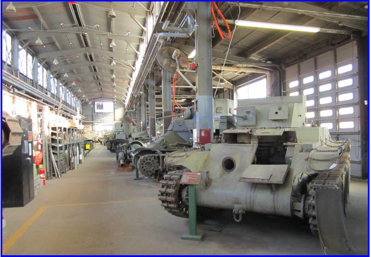
Inside the Main Facility