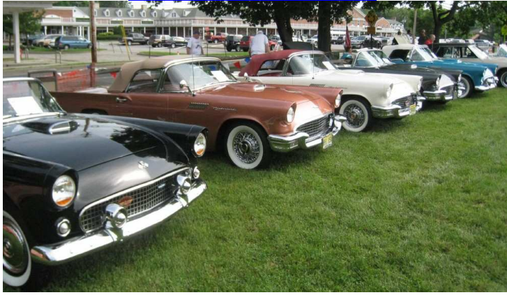
NJORTC at Franklin Lakes (not shown Pat's 57 and Charles 56)