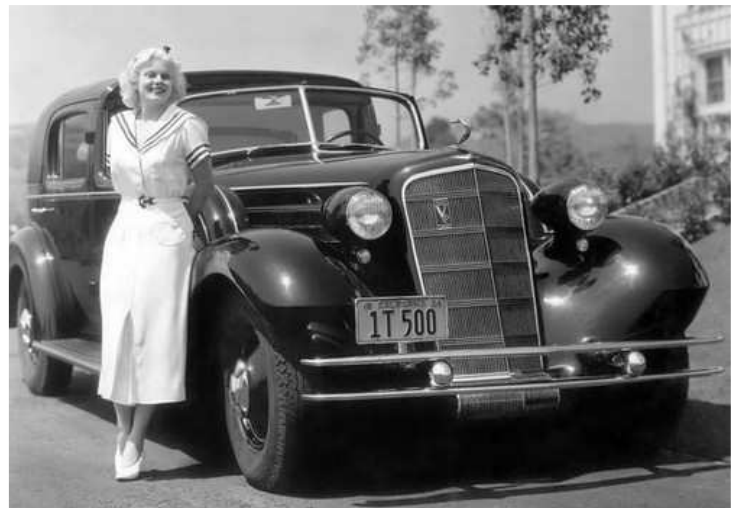
Jean Harlow 34? Caddy

Clean any corrosion from the spout for better sealing of the new hose. From the Early Bird