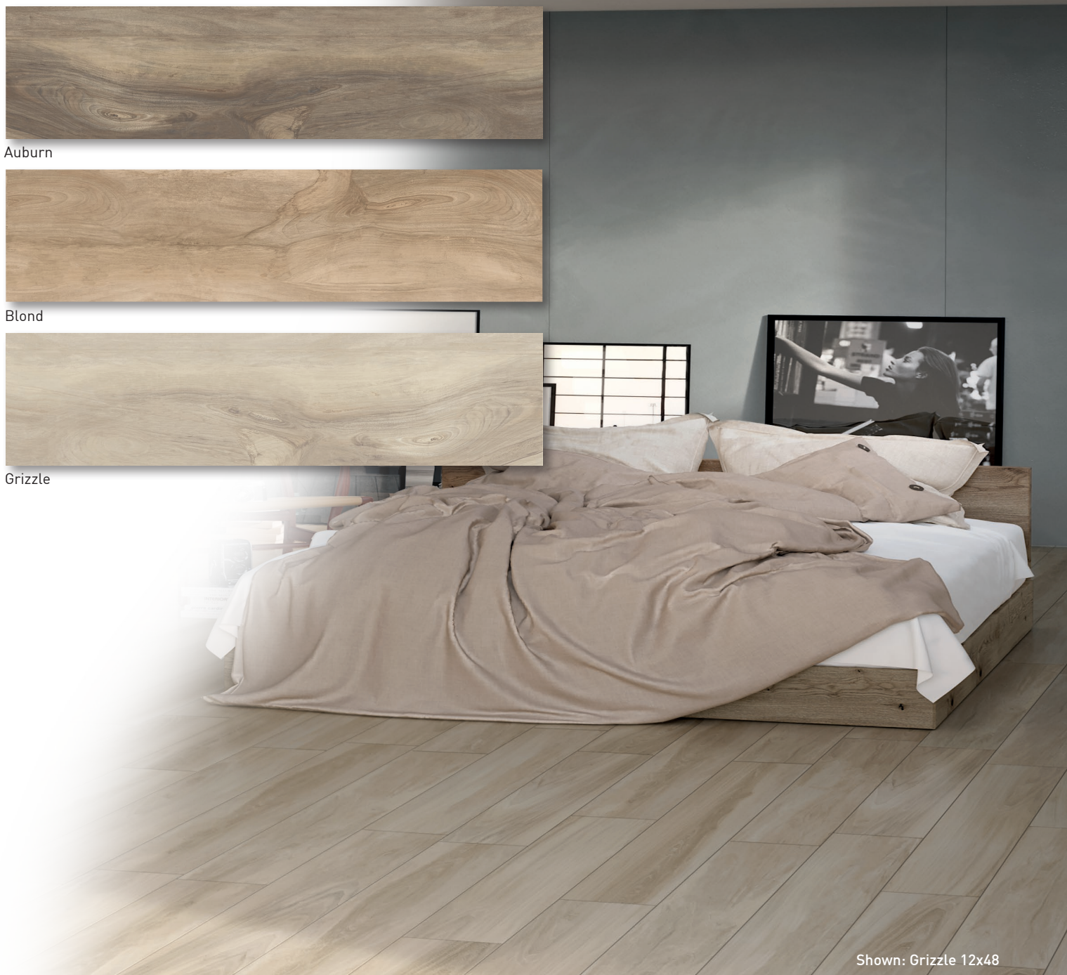
Shown: Grizzle 12x48